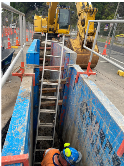
The sewer trench set up on Main Road

Drop In Sessions! Come and have a chat every Tuesday between 10am - 11am and Thursday between 12pm - 1pm. Upstairs at the Christchurch Yacht Club.