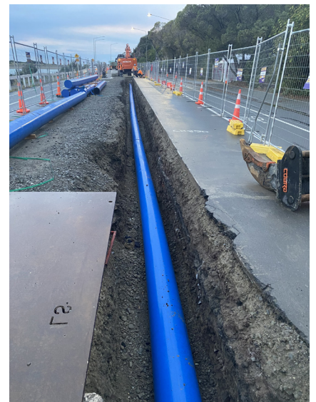
Installation of the water pipes on Main Road

If you would like to receive updates about this project, please email cant.info@fultonhogan.com with the subject 'Coastal Pathway'.