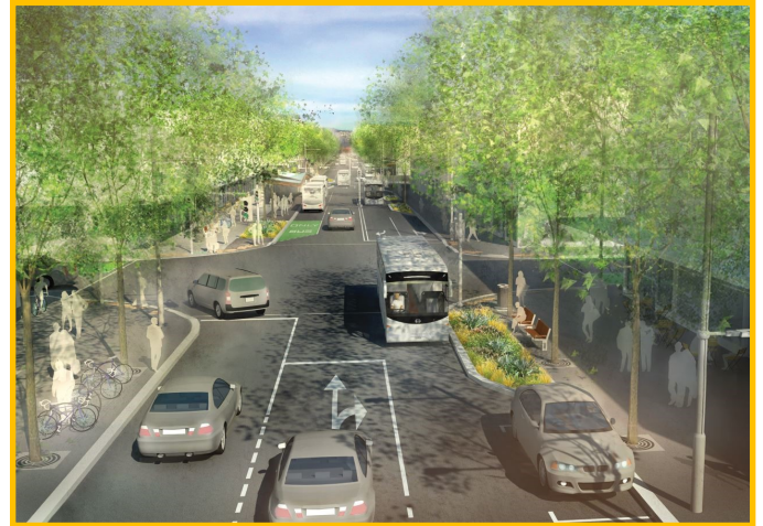
An artist's impression of Manchester Street.

Downer is delivering this project for Ōtākaro Limited in partnership with Christchurch City Council, Environment Canterbury, Te Rūnanga o Ngāi Tahu and New Zealand Transport Agency.