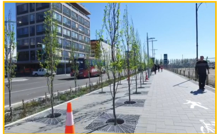
The corner of Manchester Street, Lichfield Street and High Street, in September 2016, left, and September 2017, right.