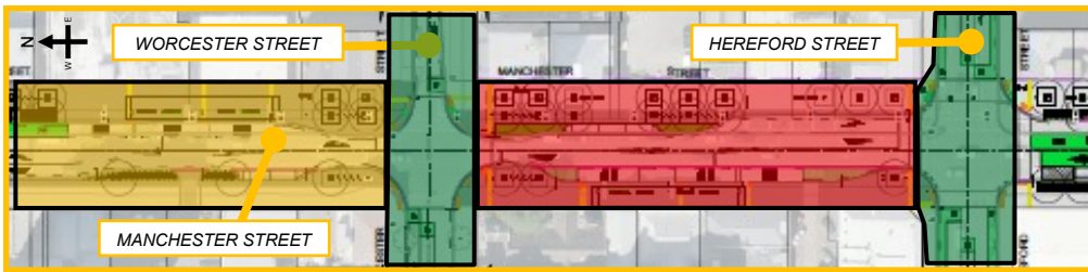
Map 2: Extent of work - Gloucester Street to Hereford Street.