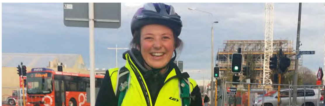
A cyclist outside the new Bus Interchange