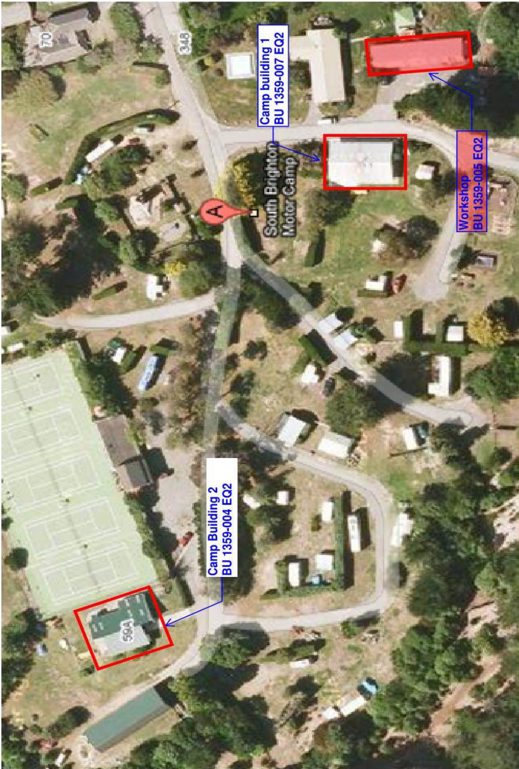
Aerial photograph of site showing the building