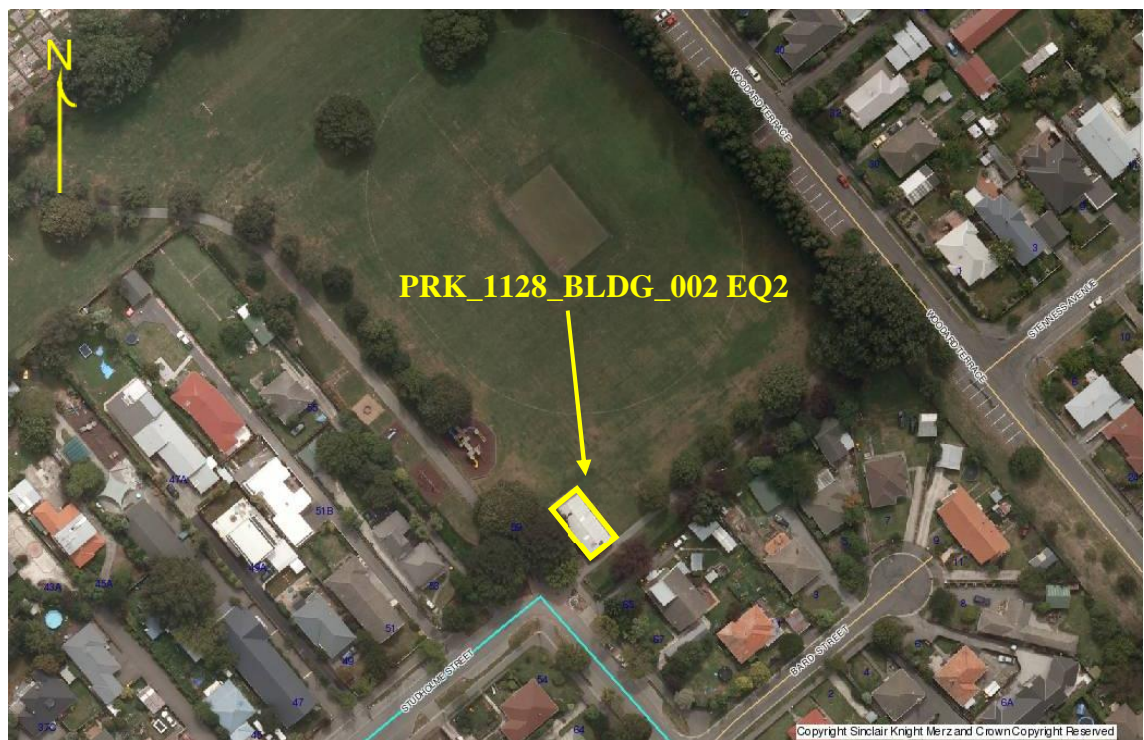
■ Figure 1: Aerial Photograph of Building PRK_1128_BLDG_002 EQ2 located at 59 Studholme Street

A quantitative assessment was carried out on building PRK_1128_BLDG_002 EQ2 located at Somersfield Park on 59 Studholme Street, Somersfield. The building is a masonry structure with a timber framed roof. It is currently utilised as a pavilion and toilet block. An aerial photograph illustrating the buildings location is shown below in Figure 1. Detailed descriptions outlining the buildings age and construction type are given in Section 5 of this report.