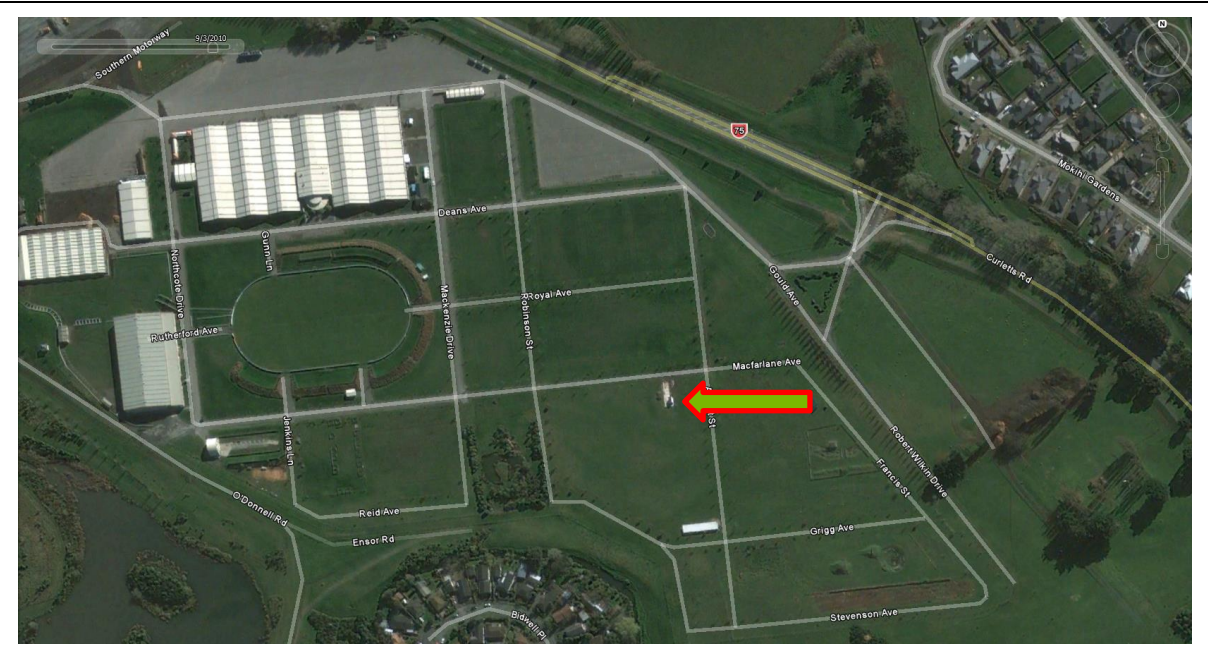
Aerial Photograph

21 August 2012 – Canterbury Agricultural Park Toilets Site Photographs