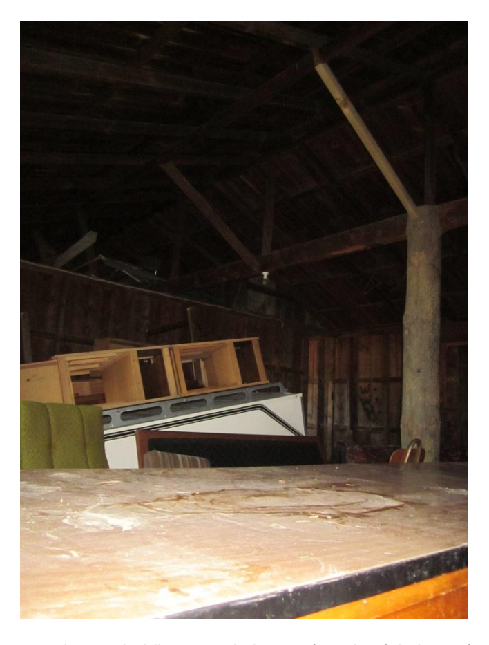
Photo showing a column, beam and struts holding up a timber roof made of timber rafters and purlins.