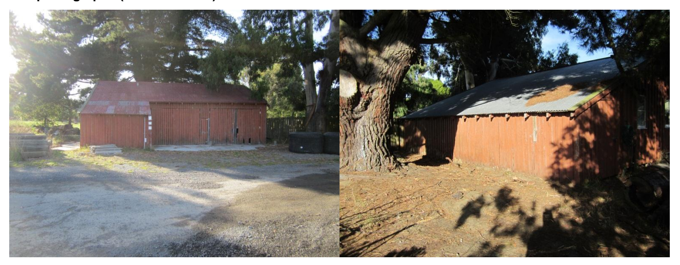
Elevations of the exterior of the old woolshed