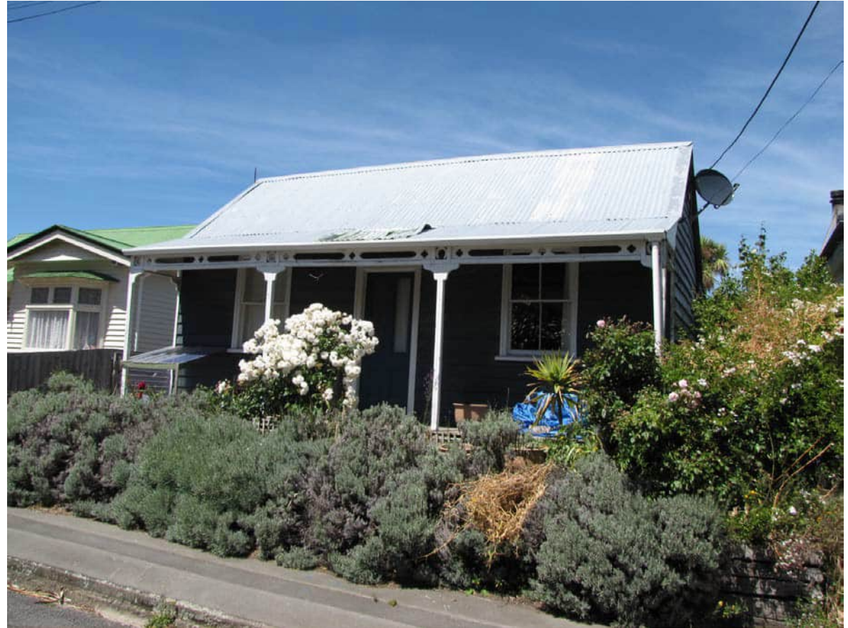
PHOTOGRAPH: BRENDAN SMYTH, 2014