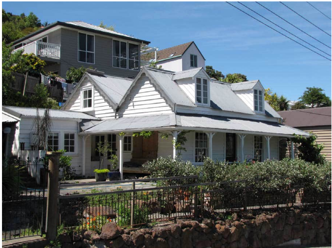
PHOTOGRAPH: B. SMYTH, 2014