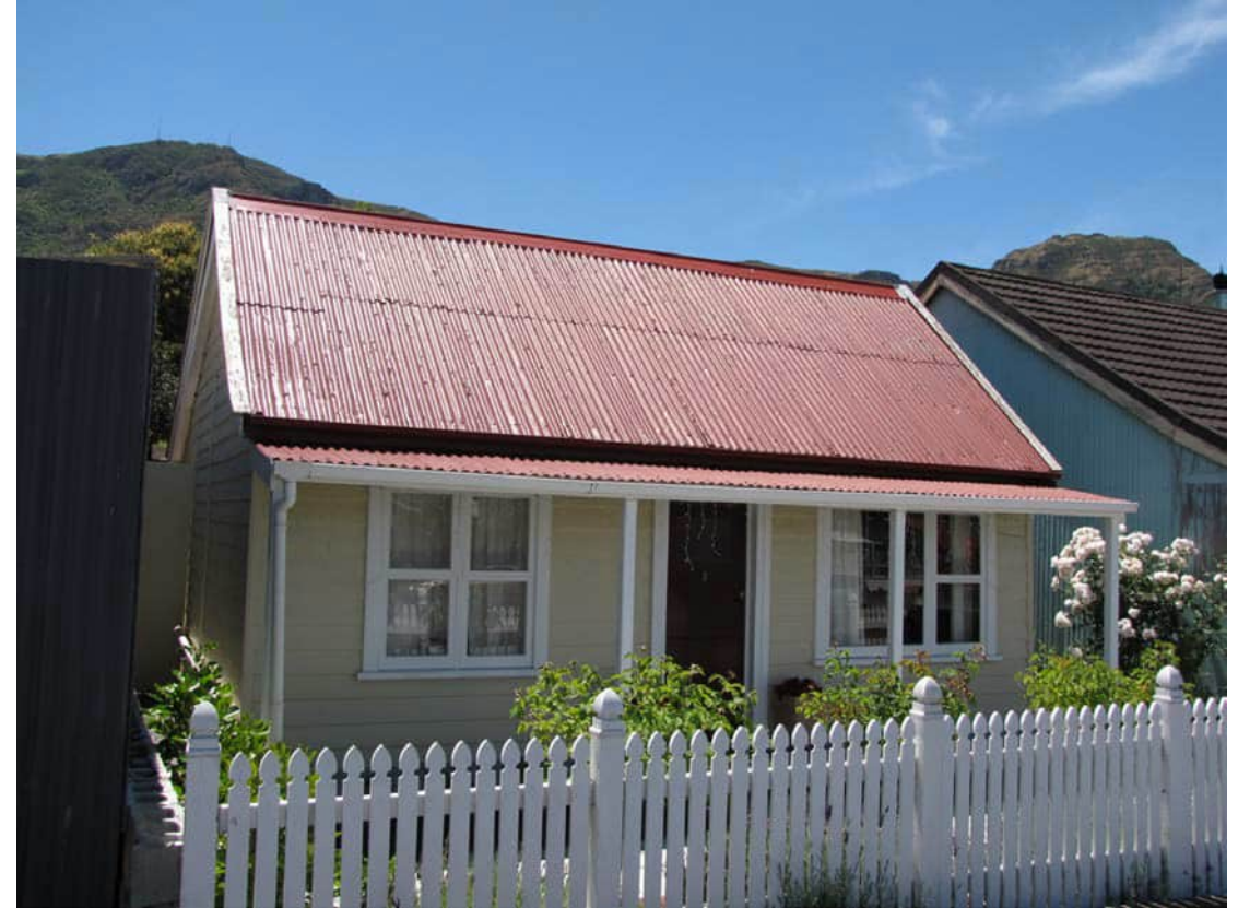
PHOTOGRAPH: BRENDAN SMYTH, 2014