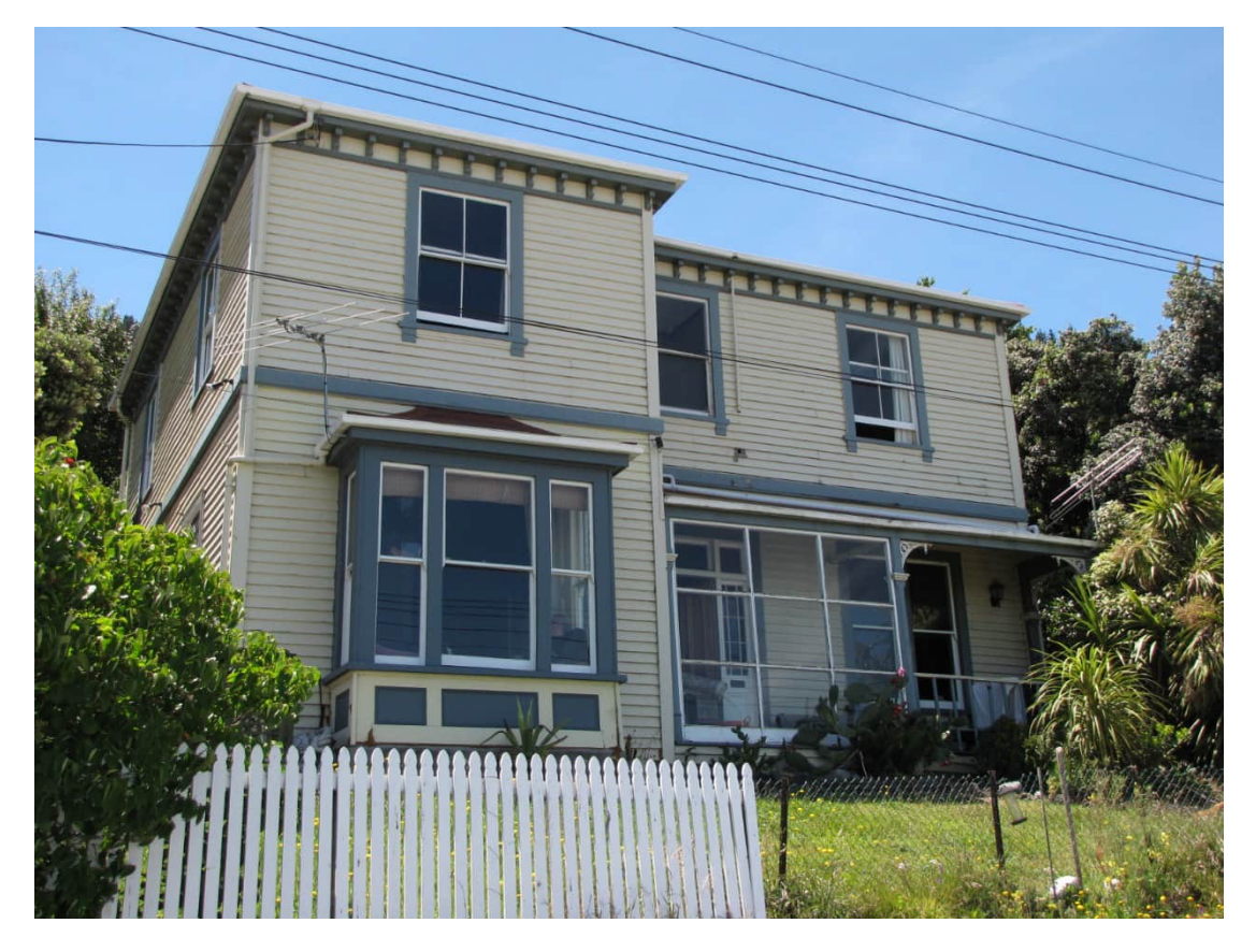
PHOTOGRAPH : BRENDAN SMYTH, 2014