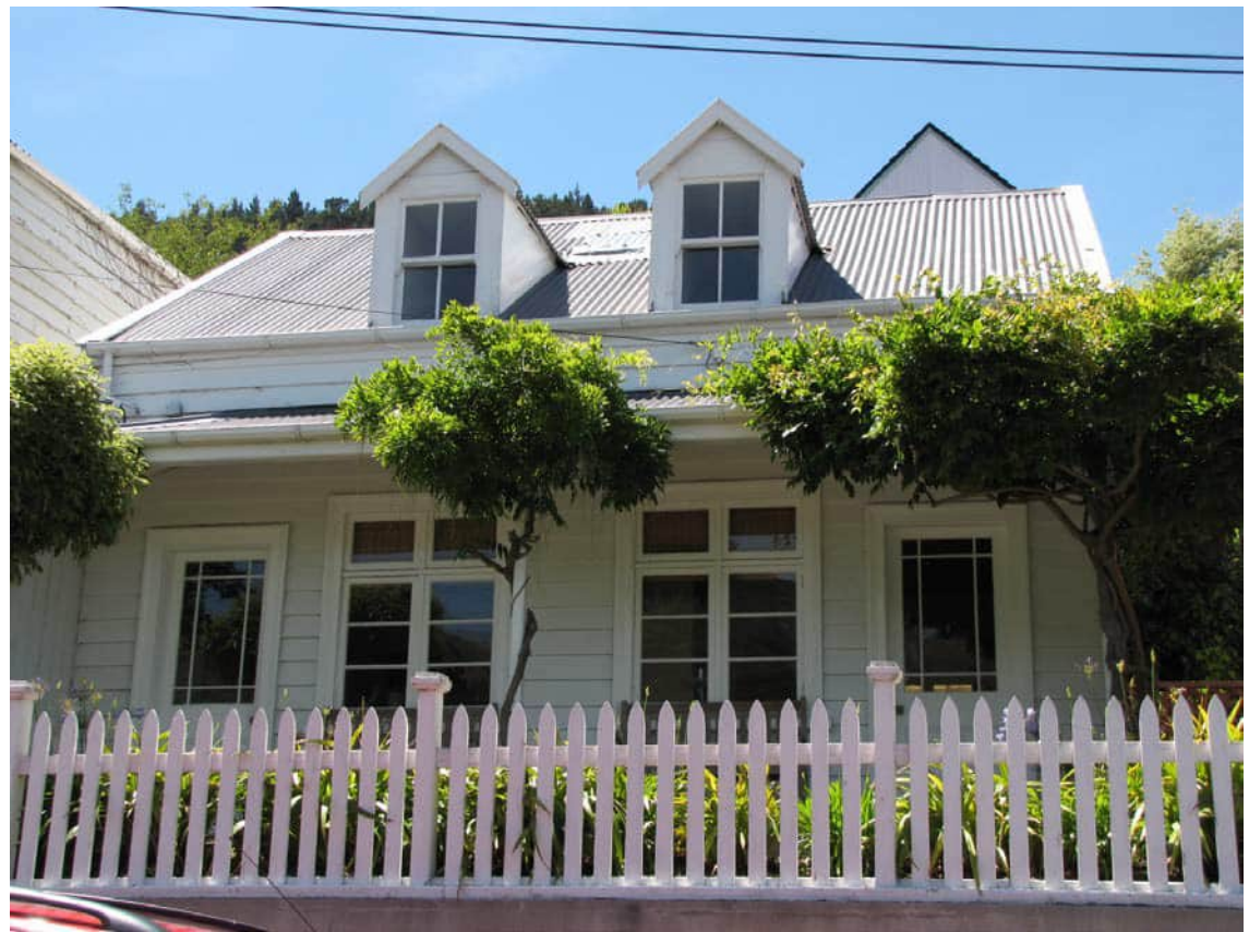
PHOTOGRAPH: BRENDAN SMYTH, 2014