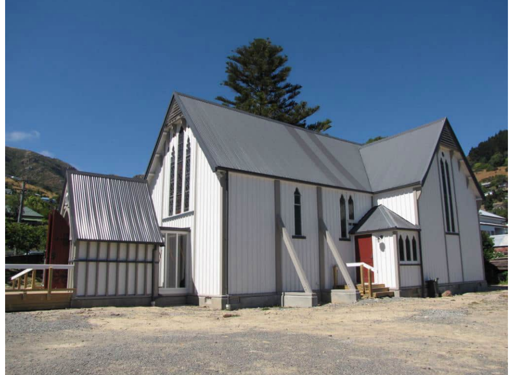
PHOTOGRAPH: B. SMYTH 09/01/2015

DISTRICT PLAN – LISTED HERITAGE PLACE HERITAGE ASSESSMENT – STATEMENT OF SIGNIFICANCE HERITAGE ITEM NUMBER 1331 ST SAVIOURS CHURCH AT HOLY TRINITY AND SETTING - 17 WINCHESTER STREET, LYTTELTON