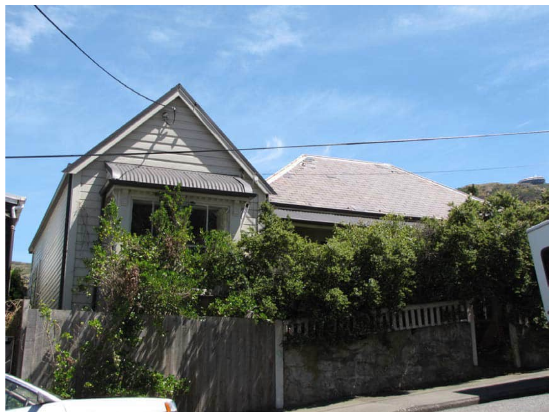
PHOTOGRAPH: BRENDAN SMYTH, 2014