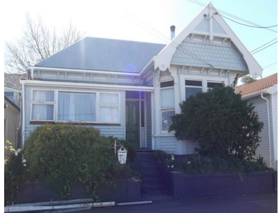
PHOTOGRAPH: SIMON DAISLEY, 2013