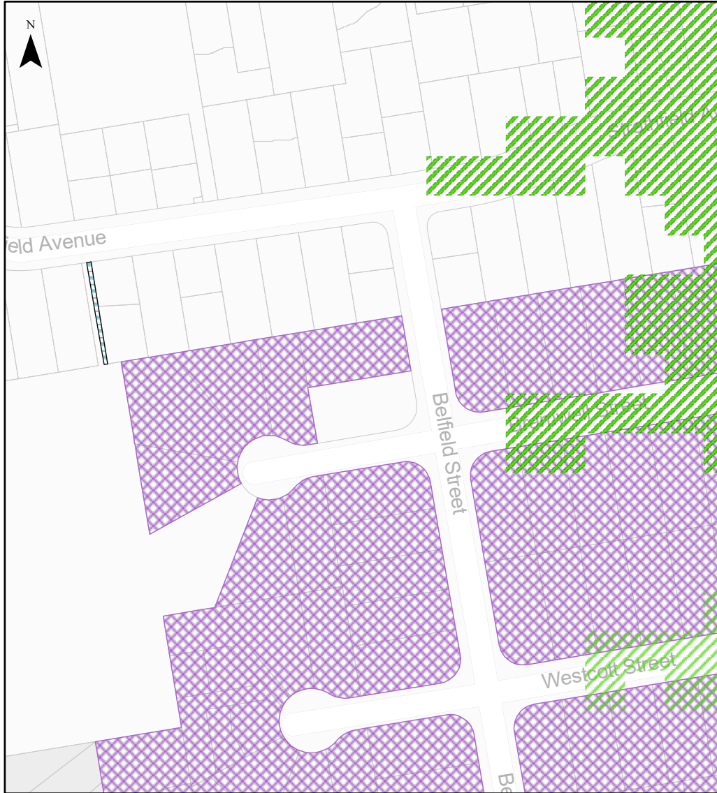
Plan Change 14 as Notified