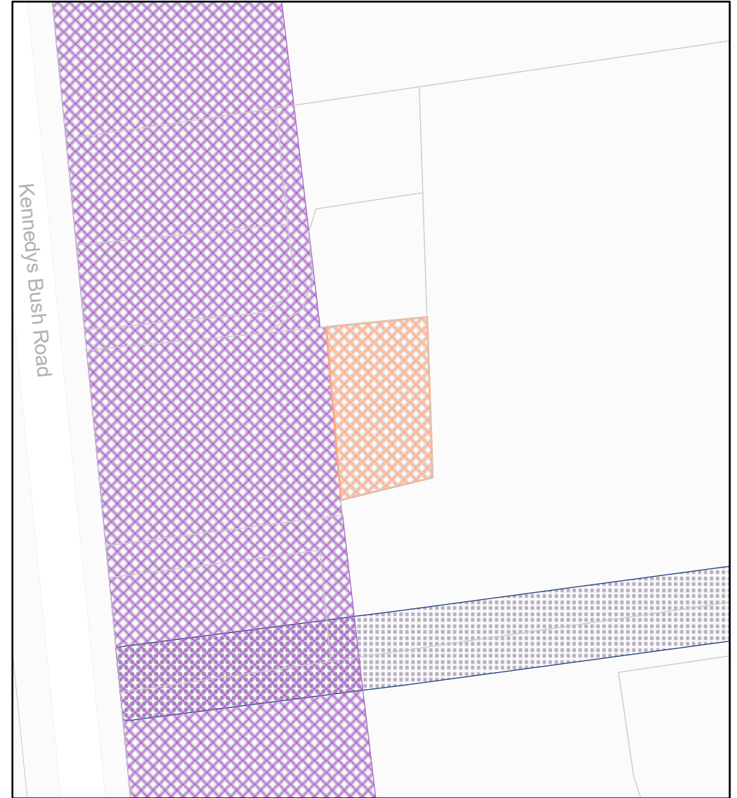
CCC Submission on notified Plan Change 14