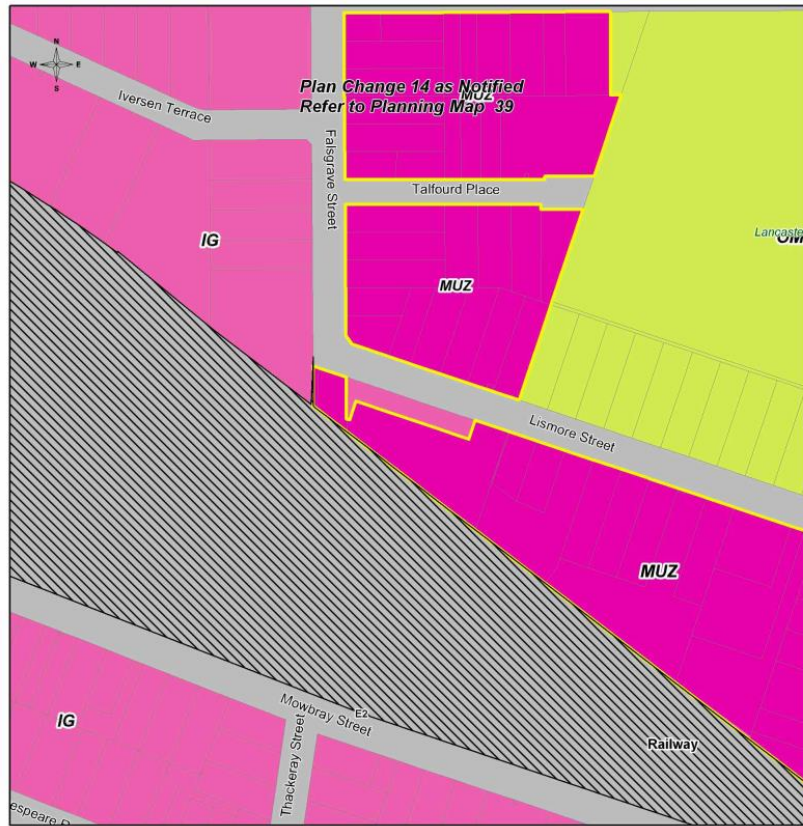
Christchurch City Council - Plan Change 14 Notified