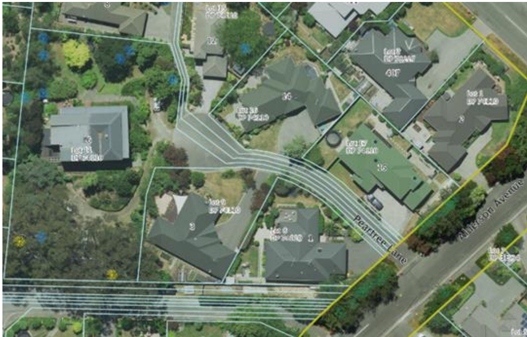
Tasman Gum Yellow dot bottom right 6 Pear Tree Lane

Ref : Variation of a Consent Notice protecting a subdivision tree Sections 95A, 95B and 104 / 104C and Section 221(3) Resource Management Act Section 333 & 334 Property Law Act 2007