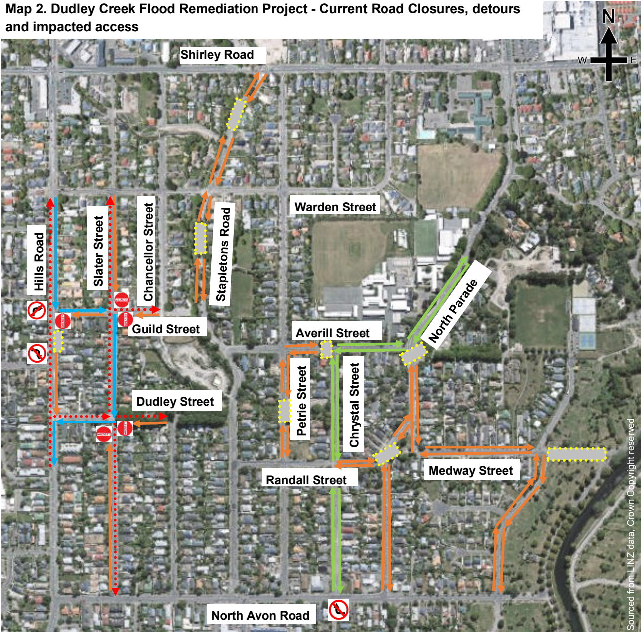
Map 2. Dudley Creek Flood Remediation Project - Current Road Closures, detours and impacted access

Please Note: This information will be updated regularly. Keep checking the website ccc.govt.nz/dudleycreek