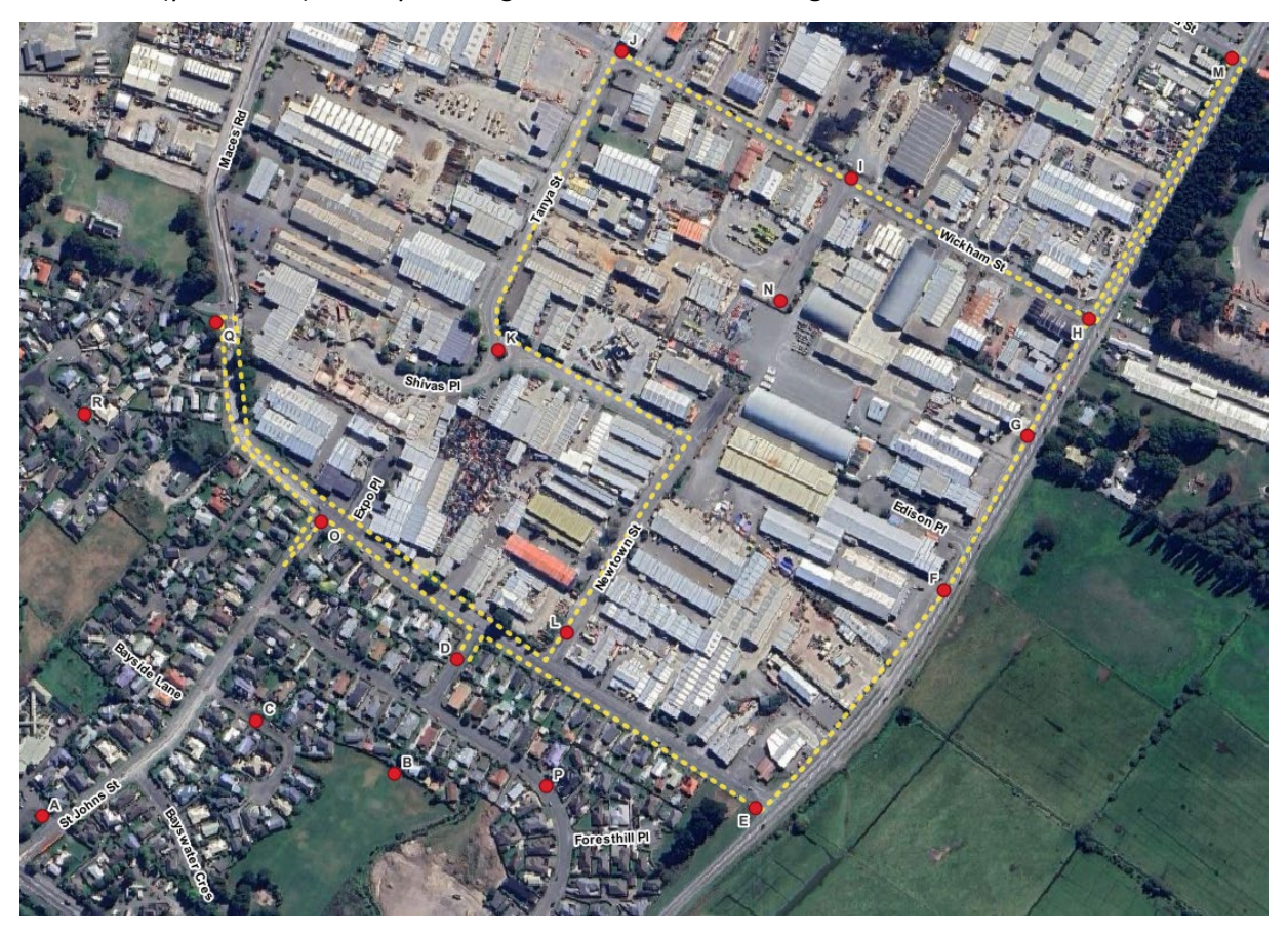
Figure 8: 29th April 2024 - Odour Scout Route

and Chris Hewlett were the PDP odour scouts. The scouts were present for approximately one hour. The weather was clear, with an average temperature of 15°C, and eastnortheasterly winds ranging from 2.7 to 3.7 m/s as a 10-minute average. The scouts started near Site O, walking the boundary of the residential area, before walking a loop of the industrial area and returning to Site O. The objective was to undertake odour monitoring in the area downwind of the LE Site. The odour scout route (yellow dots) and key scouting locations are shown in Figure 8 .