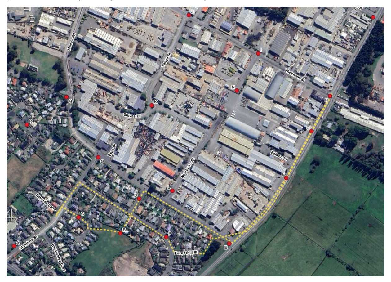
Figure 6: 23<sup>rd</sup> April 2024 - Odour Scout Route

was the PDP odour scout. The scout was present for approximately 40 minutes. The weather was clear, with an average temperature of 12 °C, and northeasterly to east-southeasterly winds ranging from 0.8 to 1.3 m/s as a 10-minute average. The scout started near Site C, before walking the boundary of the residential area and along Dyers Road towards the LE site, before returning to Site C. The objective was to undertake odour monitoring in the area downwind of the LE Site. The odour scout route (yellow dots) and key scouting locations are shown in Figure 6.