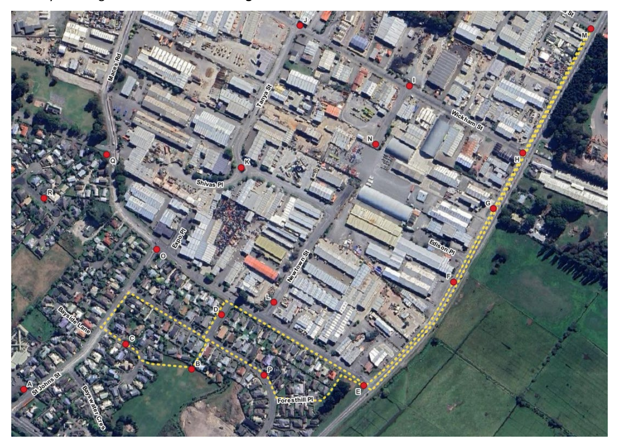
Figure 7: 24<sup>th</sup> April 2024 - Odour Scout Route

was the PDP odour scout. The scout was present for approximately 40 minutes. The weather was clear, with an average temperature of 18°C, and easterly to east-southeasterly winds ranging from 3.8 to 4.2 m/s as a 10-minute average. The scout started near Site C, before walking the boundary of the residential area and along Dyers Rd towards the LE site, before returning to Site C. The objective was to undertake odour monitoring in the area downwind of the LE Site. The odour scout route (yellow dots) and key scouting locations are shown in Figure 7 .