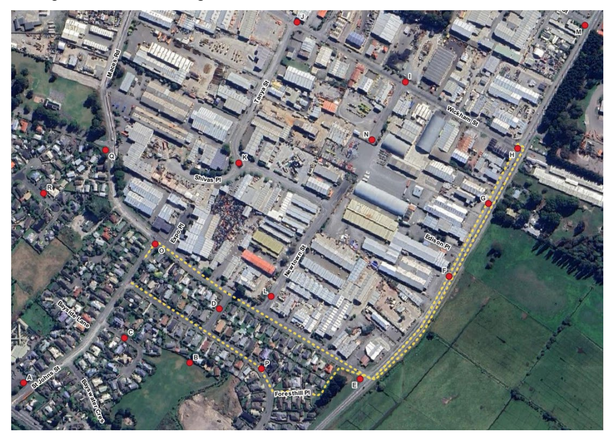
Figure 5: 17<sup>th</sup> April 2024 - Odour Scout Route

was the PDP odour scout. The scout was present for approximately 30 minutes. The weather was clear, with an average temperature of 18°C, and east-northeasterly winds ranging from 4.7 to 5.3 m/s as a 10-minute average. The scout started and ended near Site O. The objective was to undertake odour monitoring in the area downwind of the LE Site. The odour scout route (yellow dots) and key scouting locations are shown in Figure 5 .