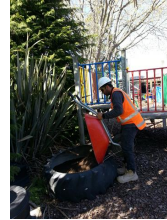
Top soil is delivered at Shirley Play Centre