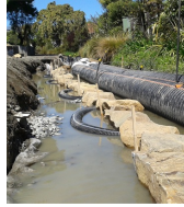
Eels caves along Dudley Creek