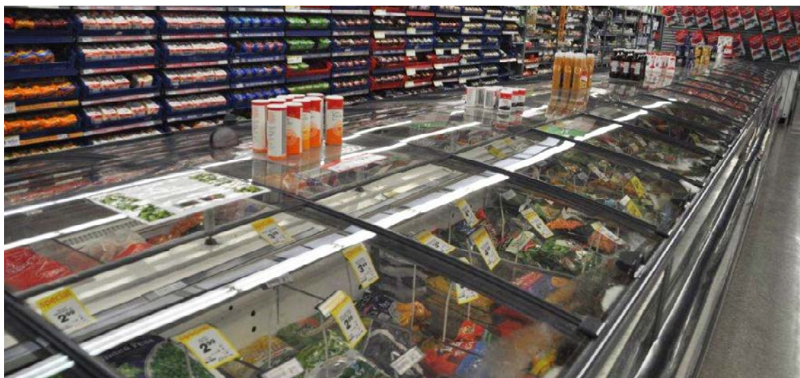
New coffin freezer lids

The estimated electricity saving is based on electricity use calculations that take into account parameters such as temperature differential between the refrigerator and the surrounding ambient temperature, size of refrigeration area and heat infiltration coefficient to determine heat transfer loads.