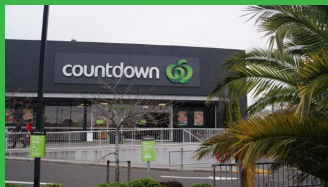
Countdown Colombo