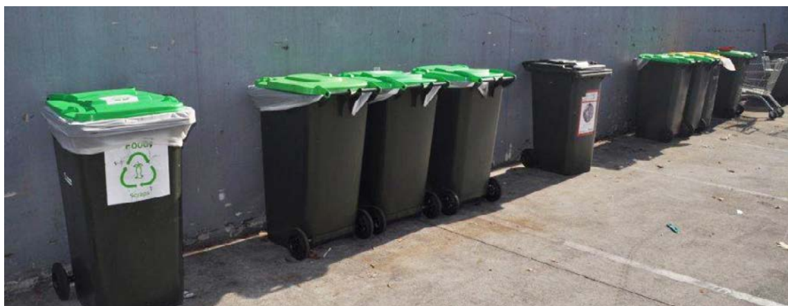
Emptied organics recycling bins used in the deli, butchery, produce and bakery areas