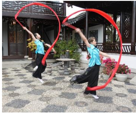
Photo: The Crater Horns entertain.

New Zealand Chinese Association, Canterbury - Our Stories – “Milestones and Moments”: This was an opportunity for the people of Ōtautahi to learn more about New Zealand Chinese heritage through historical publications ... special guests sharing their personal family stories. ... and demonstrations from the Ao Lan and Qiao Yi lion dance teams were some of the highlights. ... a successful program with many visitors attending. The guests took home knowledge ... on the struggles and tribulations about the history of the early Chinese settlers making New Zealand their home.