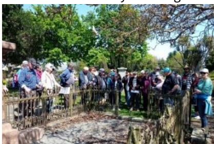
Spirited Cemetery Tour – Addington Cemetery

The success of the Heritage Festival programme relied on the work of 48 community organisations and individuals who conceived, planned and ran over 75 events. This year's theme once again attracted some new event providers, which added to the diversity and range of stories shared. There was a wide range of activities in the programme including talks, exhibitions, tours, walks, concerts, workshops and family activities. A range of age groups participated, and diverse communities held and participated in events.