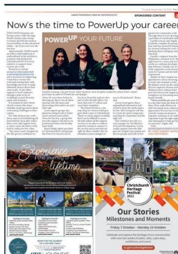
The Star - Thursday 29 September