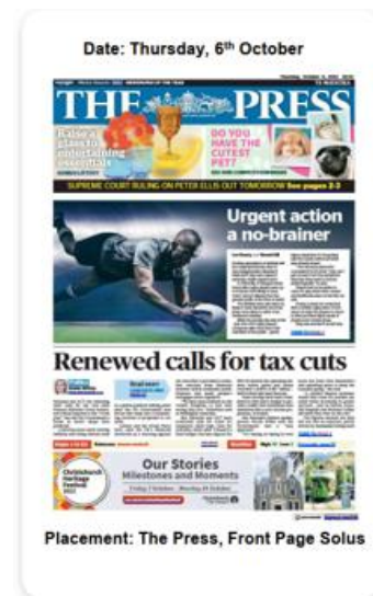
The Press - Thursday 6 October