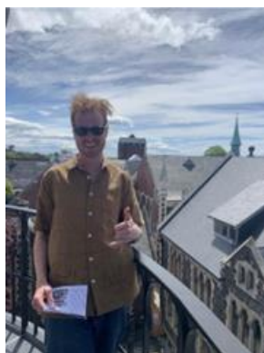
Observatory Tower and Astronomy Dome Tours

Te Matatiki Toi Ora The Arts Centre produced four events related to the ongoing development of the site and its history. Talks on the stonework restoration of the Observatory Tower and on Revival , the new exhibition on the restoration of the site, as well as tours of the Observatory Tower were held. An event which shared stories from the theatre group Pacific Underground's time based at the Arts Centre was well received.