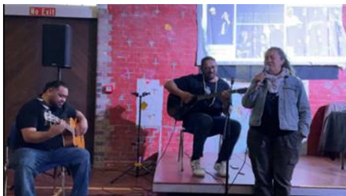
The Pacific Underground Story at The Arts Centre