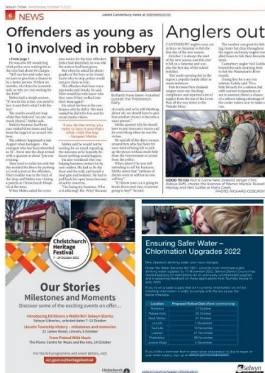
Selwyn Times – Wednesday 5 October