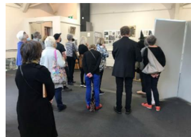
The Arts Centre Te Matatiki Toi Ora - People and Places: The Wonderful Wizard of Christchurch