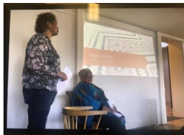
The Arts Centre Te Matatiki Toi Ora - Woven Mats of Welcome: Ngā Whāriki Manaaki