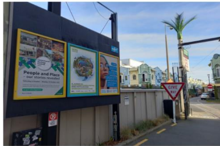
109 Worcester Street (Cathedral Junction)