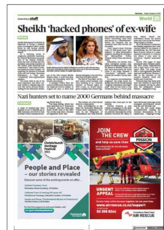
The Press - Friday 8 October