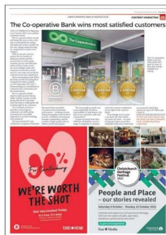
The Star - Thursday 14 October