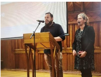
The Arts Centre Te Matatiki Toi Ora - This is our place: Tūrangawaewae

The Arts Centre Te Matatiki Toi Ora events related to their partnership with Ngāi Tūāhuriri in developing a cultural narrative for the Arts Centre, and an exhibition on the Wizard of Christchurch.