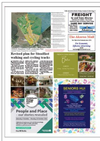
Akaroa Mail - Friday 24 September