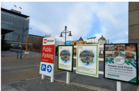
63 Worcester Street (Art Gallery)