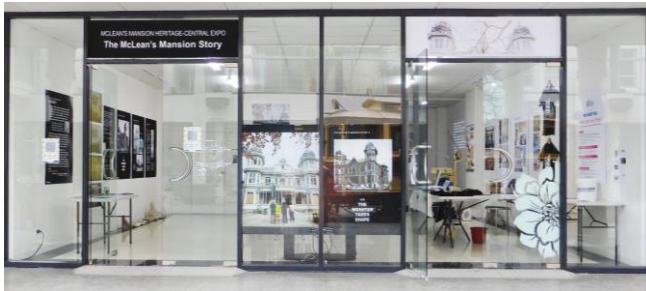
McLean's Mansion – Heritage Central Expo