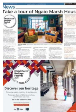
Bay Harbour News Wednesday 14 October Circulation – 30,000