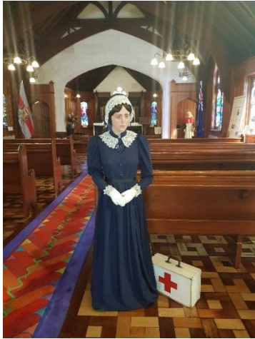
Arts and Crafts meets Florence - Nurses Memorial Chapel