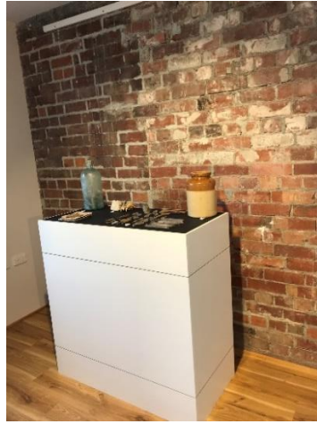
Art of Archaeology – The Arts Centre