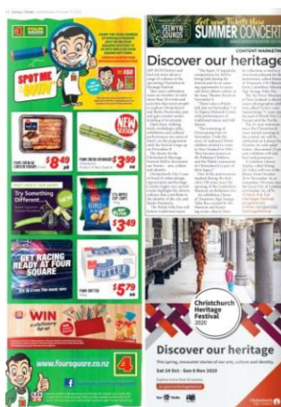
Selwyn Times Wednesday 7 October Circulation – 30,000