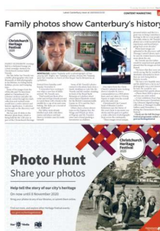
The Star Thursday 22 October Circulation – 93,000