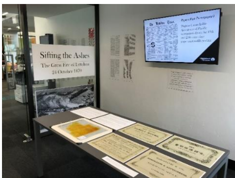
Sifting the Ashes: the Great Fire of Lyttelton 1870 - Lyttelton Library