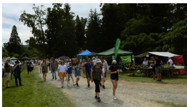
Orton Bradley Park Spring Fair

The scale of events ranged from small events targeted to specialist interest areas, to a collaboration with Orton Bradley Park. The annual Spring Fair ran successfully this year and attracted a crowd of around 6,500 people.