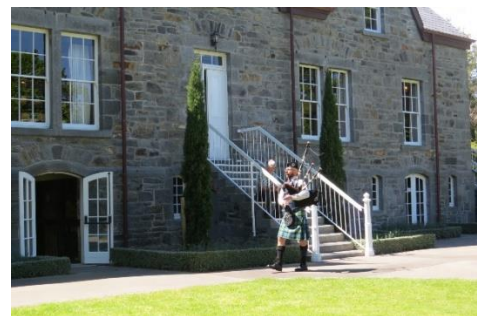
Celebrating 150 Years at the Old Stone House - Open Day