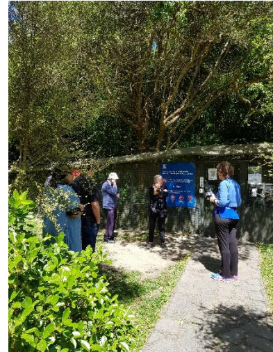
Pūtaringamotu/Riccarton Bush - Discover its roots