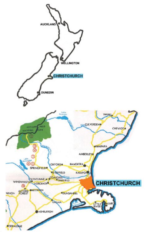
CHRISTCHURCH CITY CONTEXTUAL HISTORICAL OVERVIEW - PROJECT 1 INTRODUCTION MAP SCALE 1 : 100,000