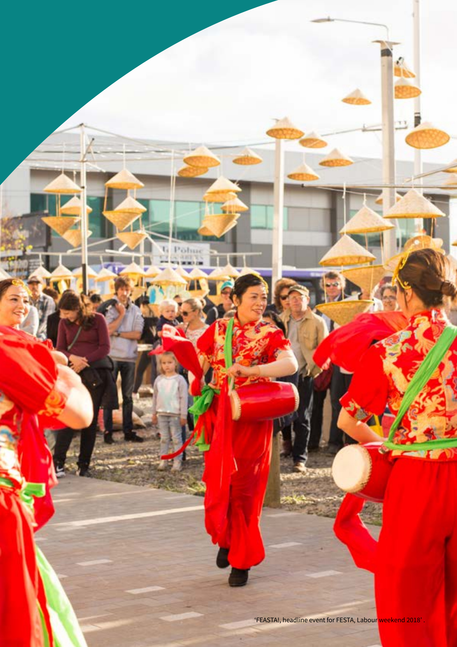
'FEASTA!, headline event for FESTA, Labour weekend 2018'.