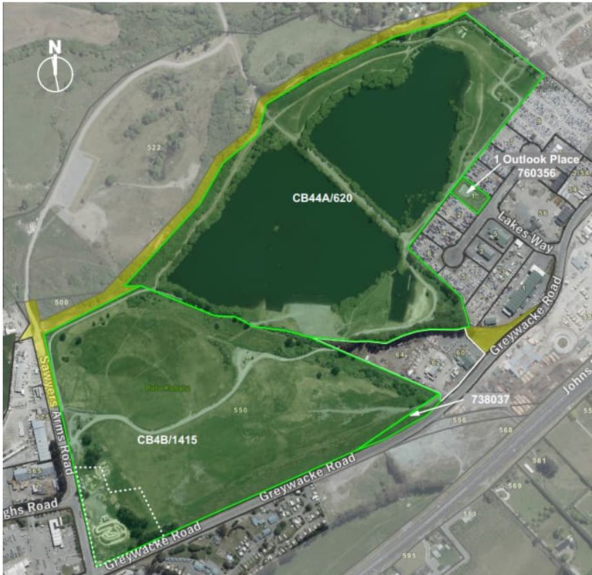
Figure 4: Land Parcels that make up Roto Kohatu Reserve.

Note: Park land is shaded green and adjoining legal unformed road is shaded yellow