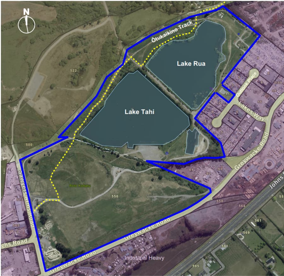
Figure 2: Map with Roto Kohatu Reserve outlined in blue

The reserve is encompassed by Sawyers Arms Road in the west and Greywacke Road in the east and south. The Ōtukaikino Track begins at the main entrance to the reserve from Sawyers Arms Road.