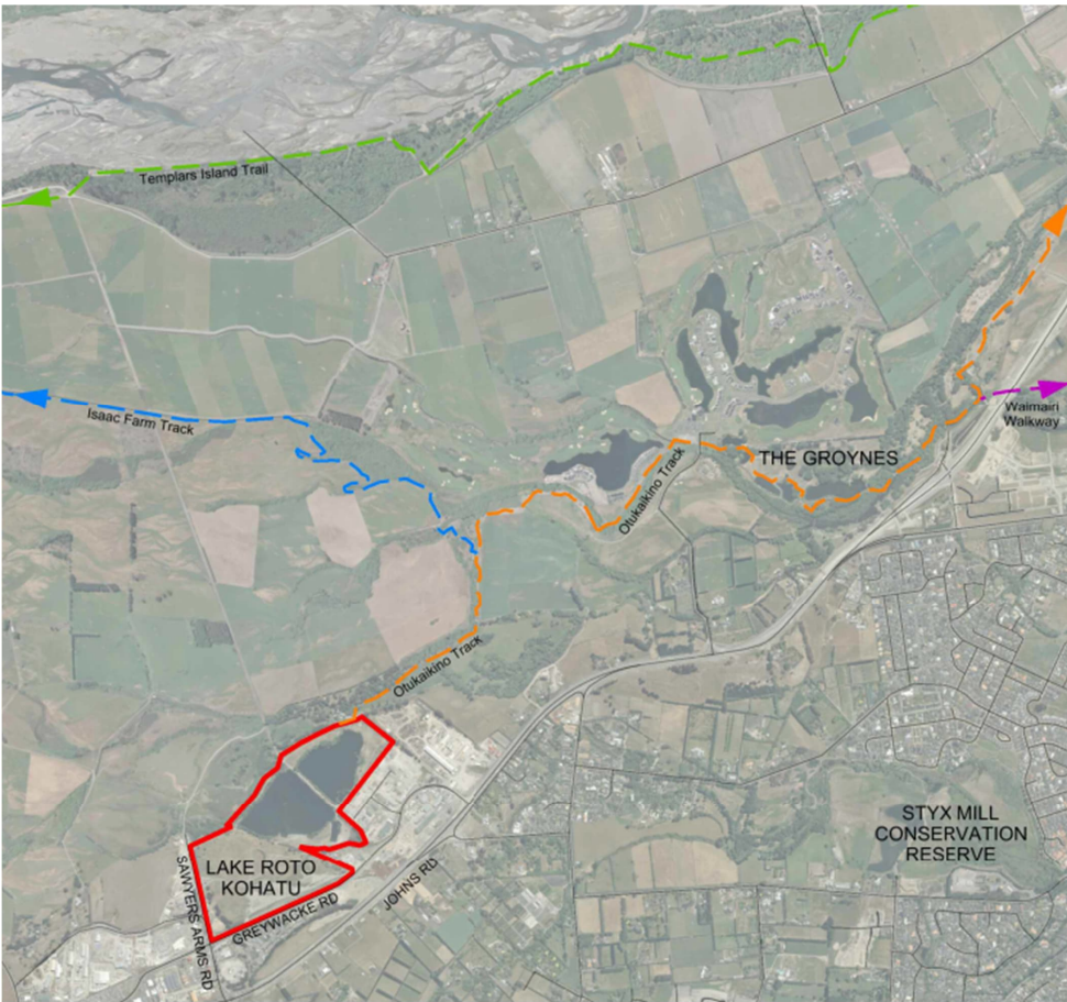
Figure 1: Location map

Roto Kohatu Reserve borders Sawyers Arms Road and Greywacke Road and is ten kilometres north-west of the centre of Christchurch near Christchurch International Airport. The Ōtukaikino Track connects Roto Kohatu Reserve with The Groynes and Darroch Reserve, and has further connections to the Isaac Farm Track, Waimairi Walkway and Templars Island Trail.