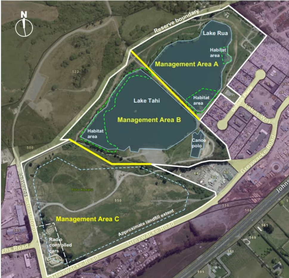
Figure 3: Habitat and management areas

Commented [SA1]: Plan deleted and updated with plan showing revised habitat areas