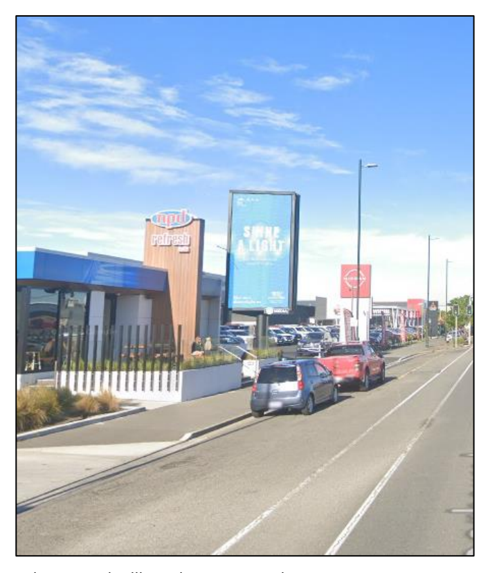
Figure 4: Free-Standing Digital Billboard at 392 Moorhouse Avenue – Commercial Retail Park Zone

In our opinion, free-standing digital billboards similar to the proposal are more appropriate in other commercial and industrial areas where the expected amenity is lower than the Manchester Street site. Examples of this type of signage are given below.