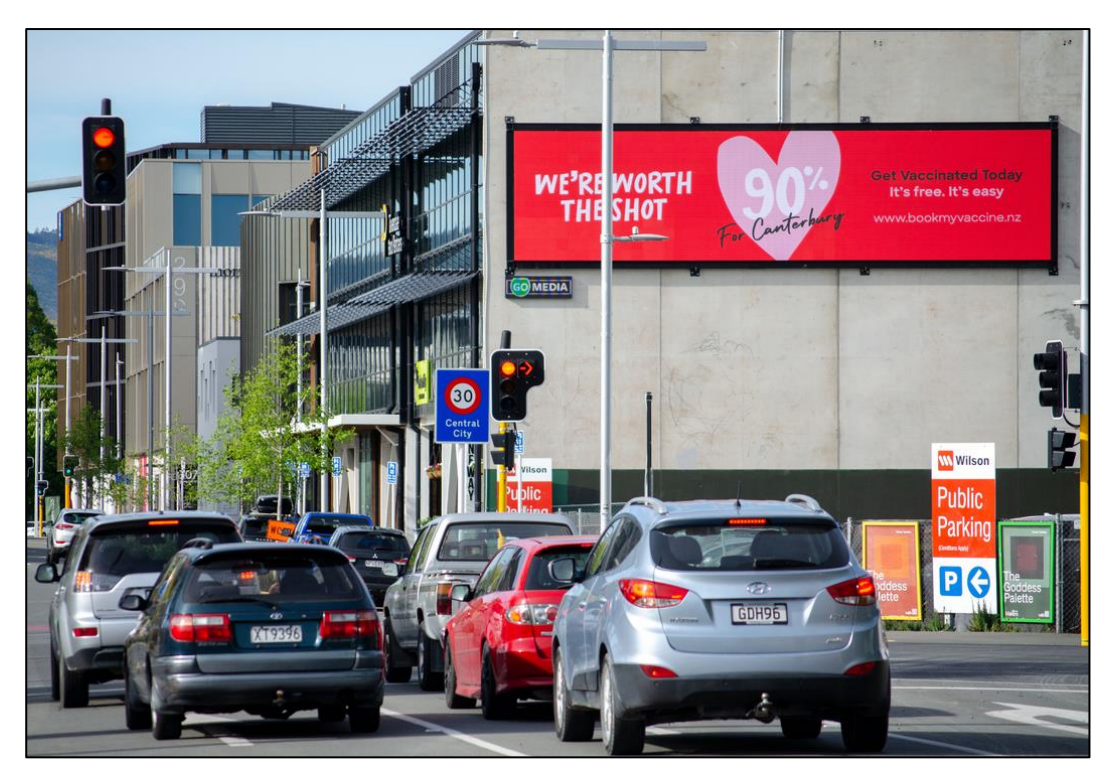
Figure 2: Digital Billboard at 329 Durham Street North within the Central City Inner Zone Overlay