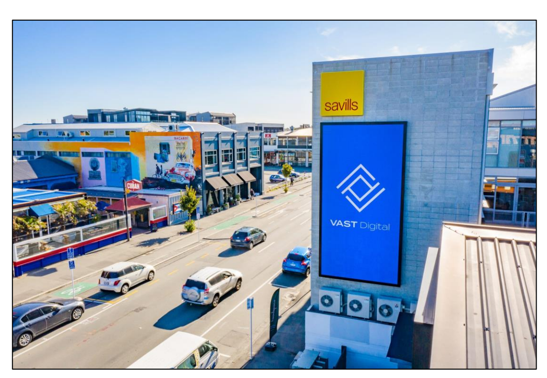
Figure 3: Digital Billboard at 245 Saint Asaph Street within the Central City Inner Zone Overlay

As demonstrated above there is a precedent for digital billboards within the inner central city to be attached to buildings and it is the position of this submission that this is the appropriate standard for any digital advertising within the central city.