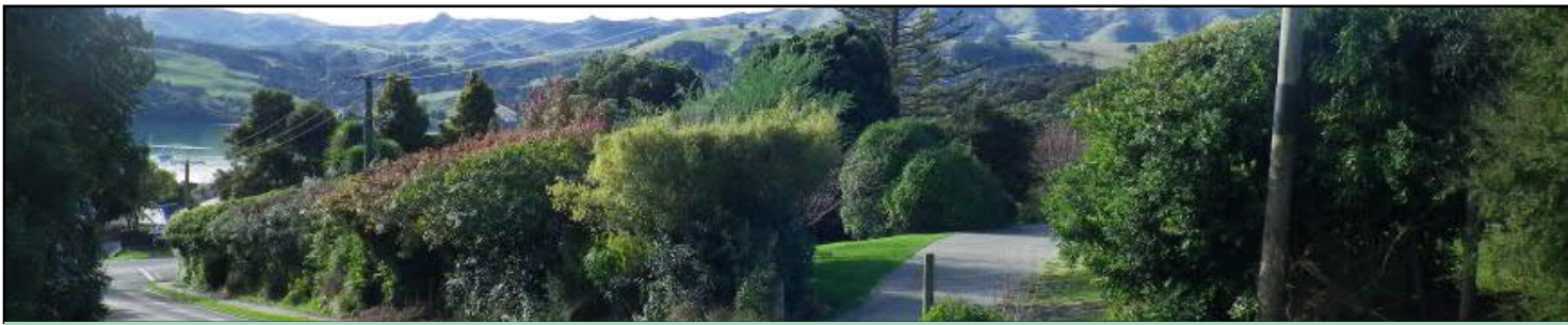
Akaroa Community Health Centre site