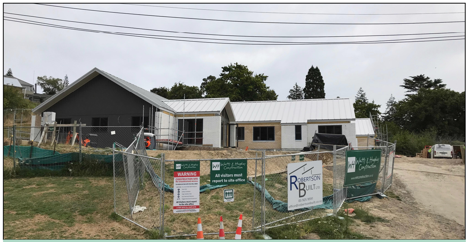
Construction works at the Akaroa Community Health Centre site