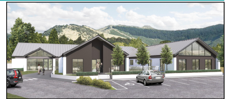
Artist impression of the Akaroa Health Centre

Saturday 9 March 2019, 9.30 am - 11.30 am Akaroa Farmers Market Madeira Car Park, 48 Rue Lavaud, Akaroa