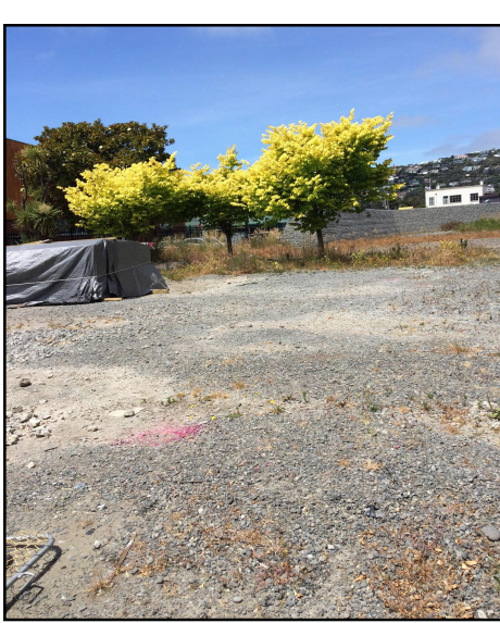
Nayland Street site