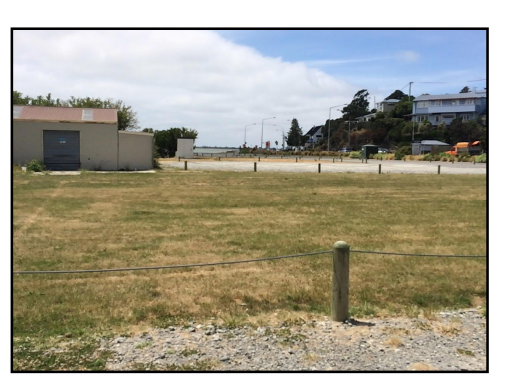
Scott Park site in Ferrymead