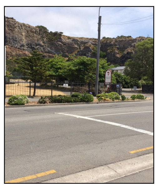
Old Redcliffs School site