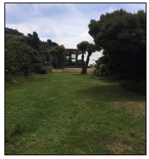
Site next to Sumner Surf Lifesaving Club