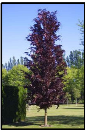
Fagus Dawyck Purple (fastigate beech)