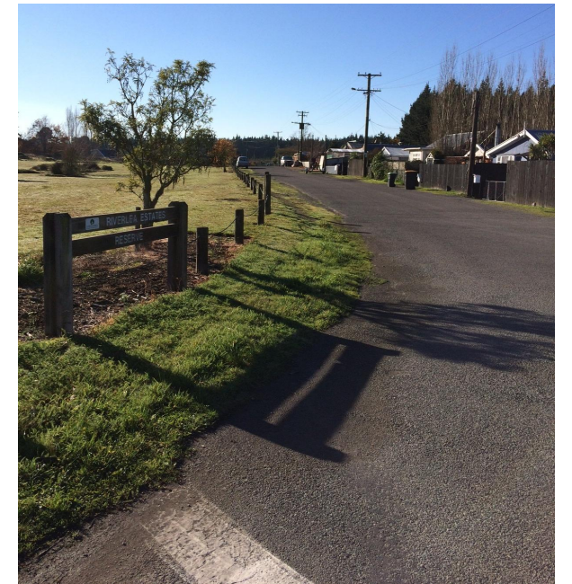
Riverlea Estate Drive

Please refer to the plan overleaf for more detail on the proposal that you can provide feedback on.