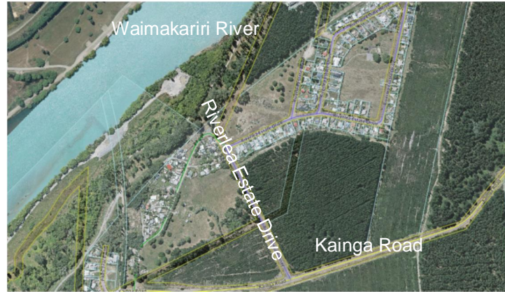
Riverlea Estate Drive, located near the river

All submitters will receive written updates on the project, including details of the staff recommendations and meetings, and how to request to speak at the meeting if they wish to do so.