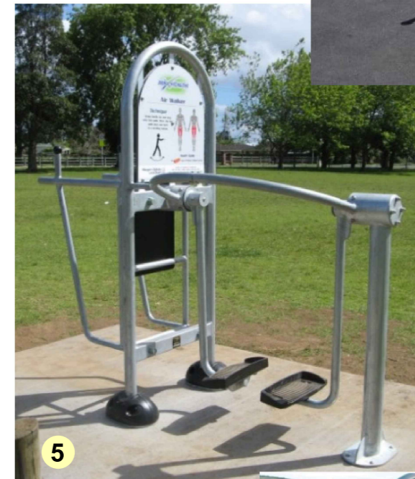
AIR WALKER / DIP & CRUNCH