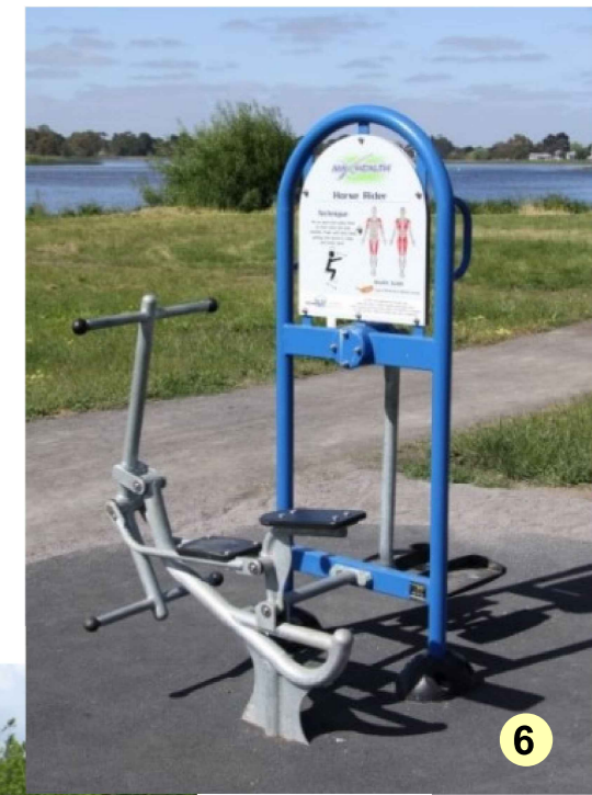
SKIER / HORSE RIDER

All images are indicative only and represent the type of activity/equipment. 1. Push-up bars 1, Parallel bars 2 and Chin Up Bars 3 to be placed on an appropriate safety surface. 2. Fitness equipment, items 4, 5 and 6 to be placed on either an asphalt or concrete pad as per the manufacturers specification and accessed by an asphalt path.