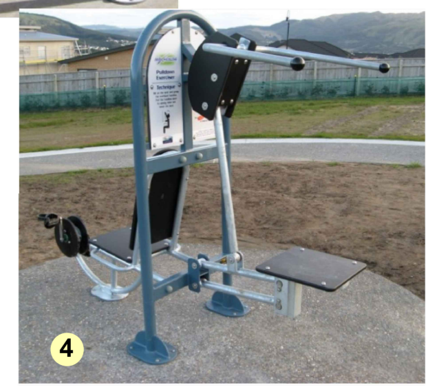
RECUMBENT CYCLE / PULL DOWN EXERCISER