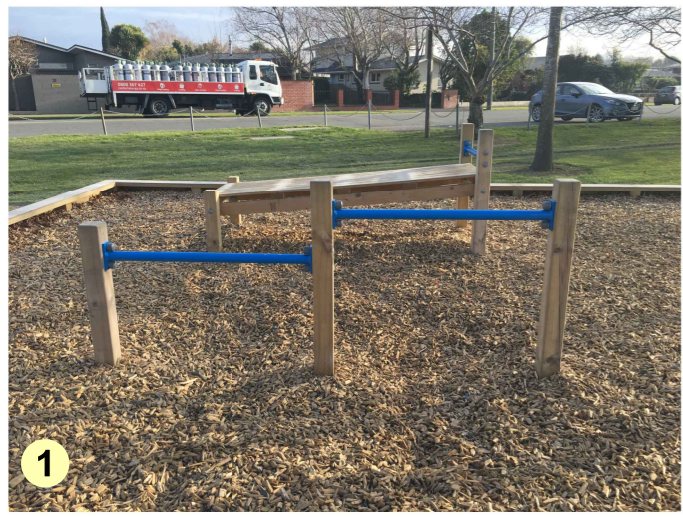
PUSH-UP BARS (in foreground)