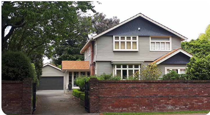
Weatherboard cladding, box windows, and shingle gable ends illustrated are characteristic features of English Domestic Revival