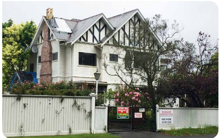
Examples of English Domestic Revival Houses on Heaton Street