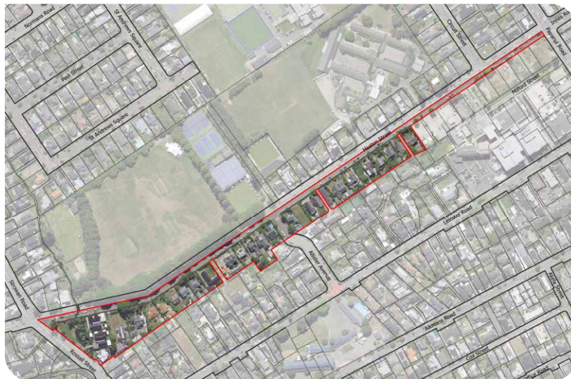
Map of Heaton Character Area – Operative 2 December 2024

* For further District Plan advice please contact Christchurch City Council on (03) 941 8999 and ask for a Duty Planner, or for design assistance ask for an Urban Designer.