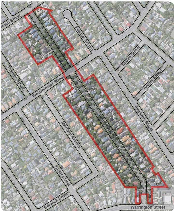
Map of Francis Character Area

* For further District Plan advice please contact Christchurch City Council on (03) 941 8999 and ask for a Duty Planner, or for design assistance ask for an Urban Designer.