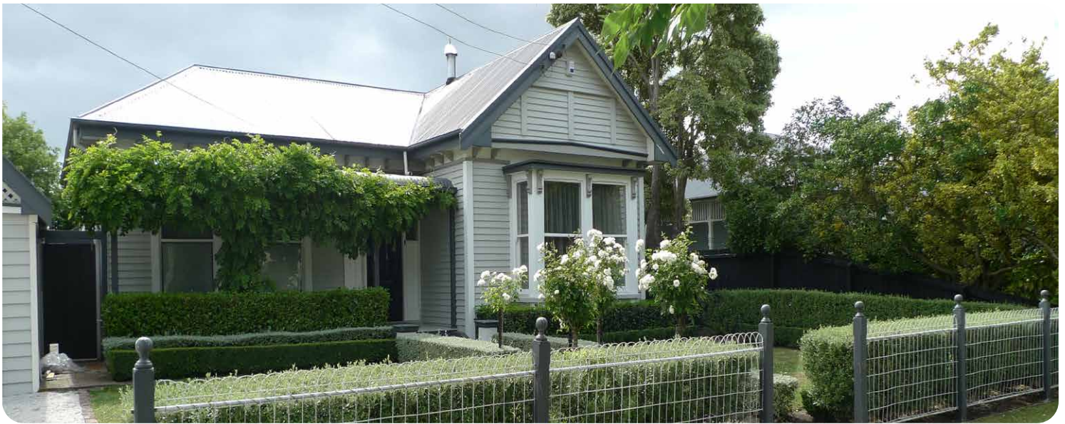
Example of a villa on Francis Street