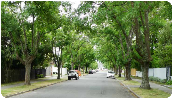
Street trees on Francis Street