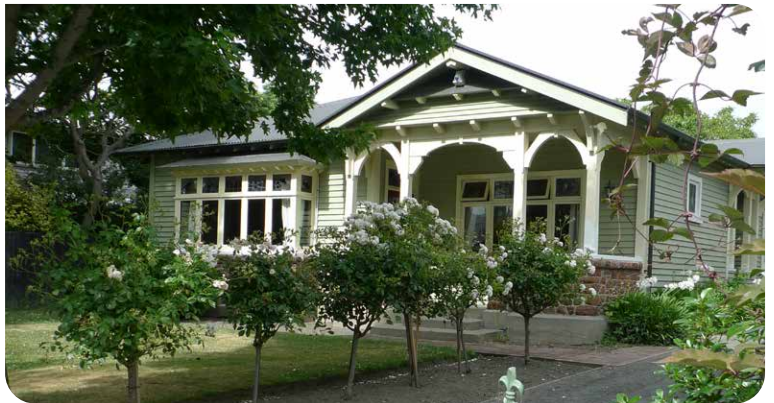
Example of a bungalow on Francis Street