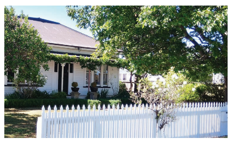
Early 20th century weatherboard dwelling with veranda, symmetrical large front windows, low fence and path to the front door