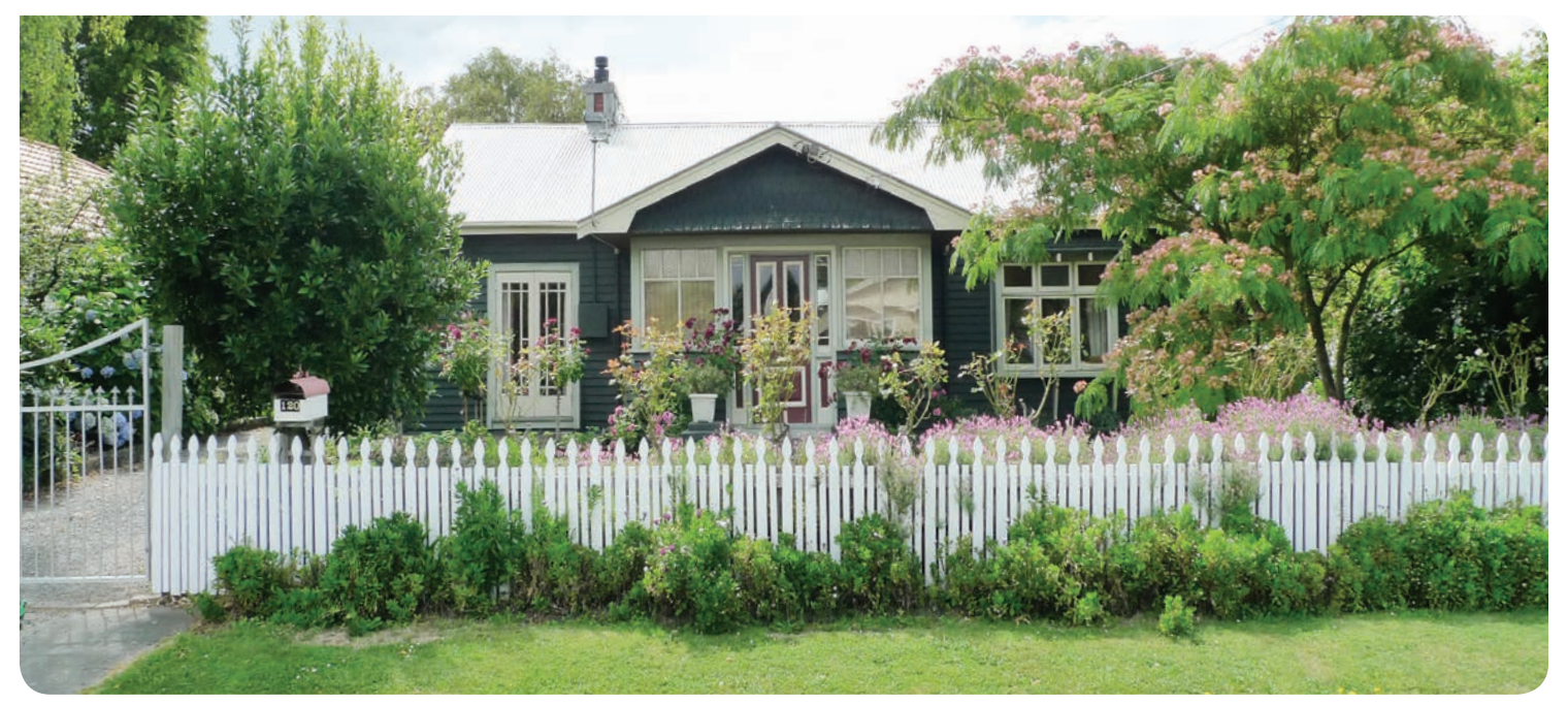
Example of a bungalow on Slater Street.