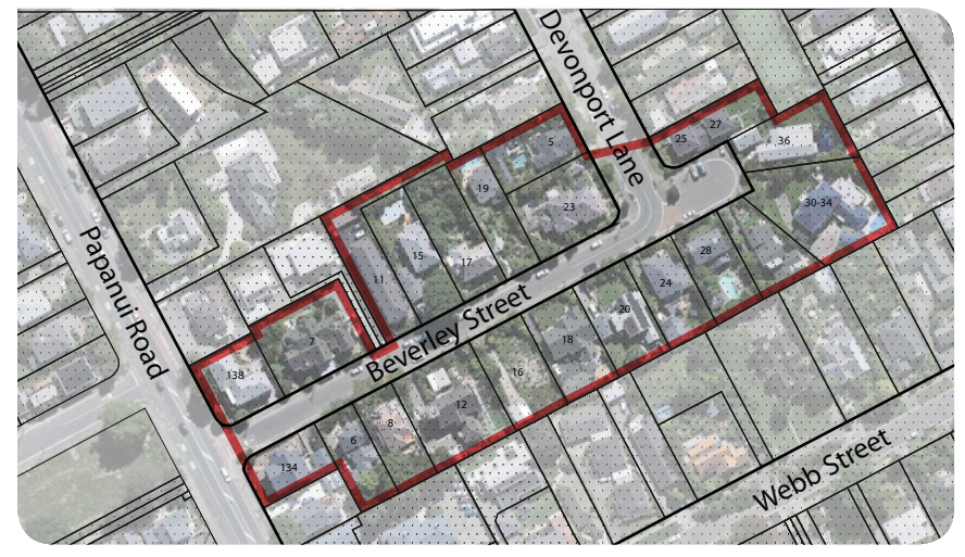
Map of Beverley Character Area