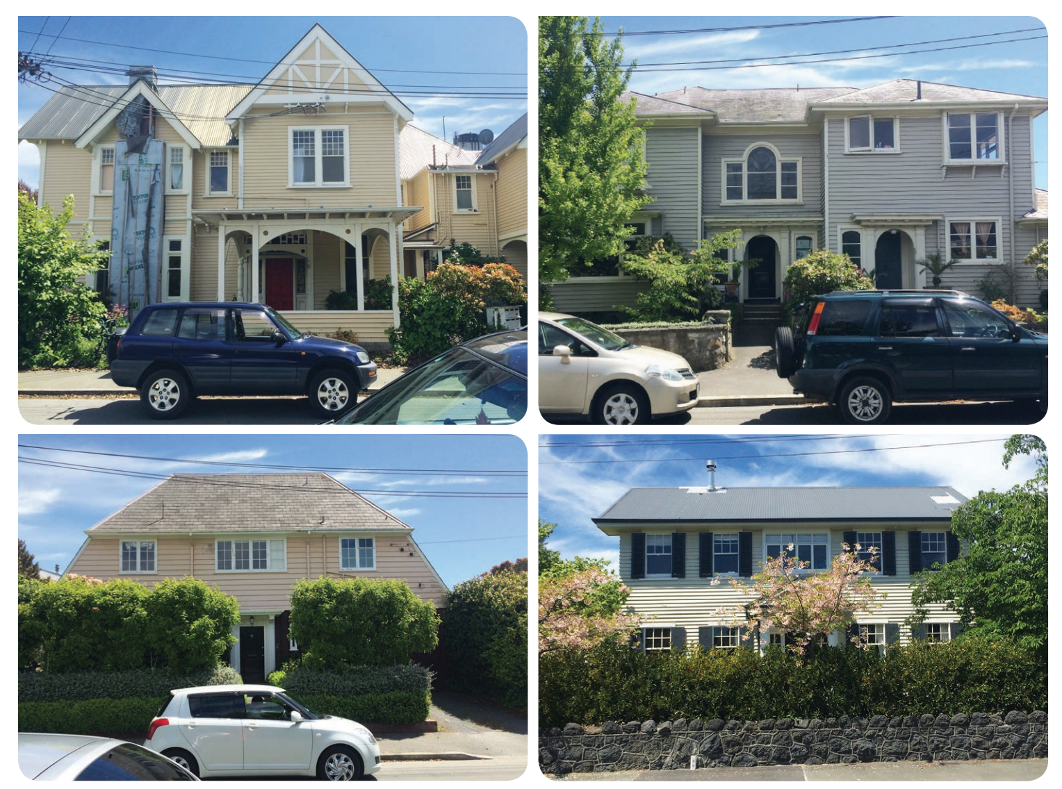
Examples of the typical mix of house styles in Beverley