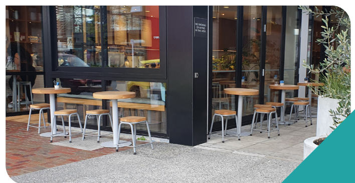
An example of temporary outdoor dining.