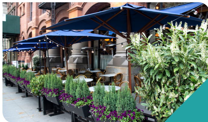
An example of standard outdoor dining.