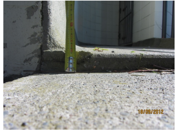
Photo 6: Close up view of photo 5, showing difference of 45mm between pavement and toilet entrance levels.