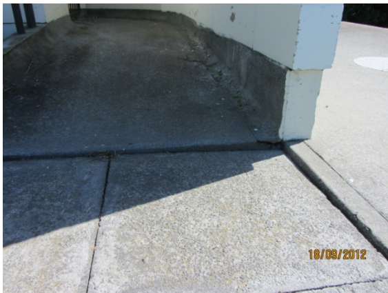
Photo 7: Entrance to mens toilet also showing difference in levels between entrance and pavement.