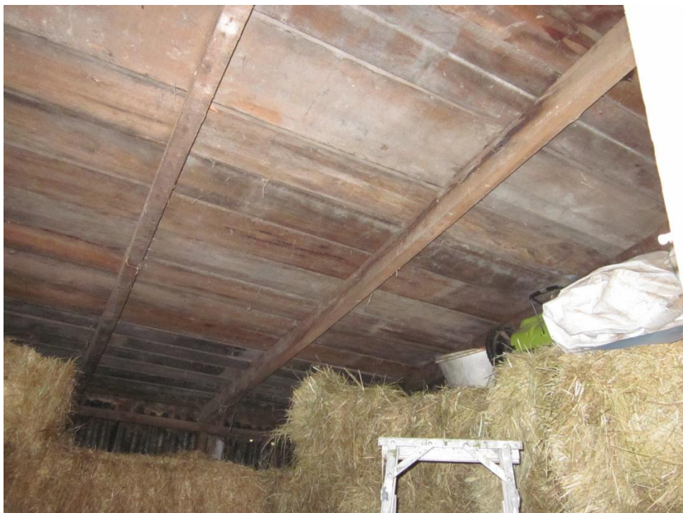
Photograph 16: Roof rafters and sarking at addition.