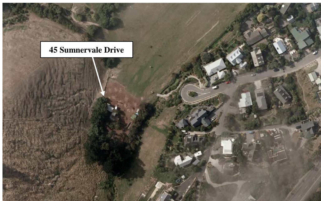
Figure 3 Post February 2011 Earthquake Aerial Photography 3

Aerial photography taken following the 22 February 2011 earthquake shows no obvious signs of liquefaction in the vicinity of the site (see Figure 3).