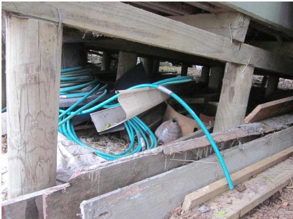
Photograph 10: Timber piles and floor structure under house.