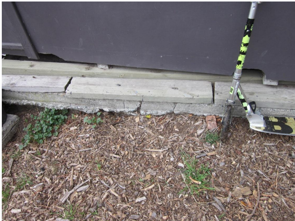
Photograph 8: Foundation under small shed structure.