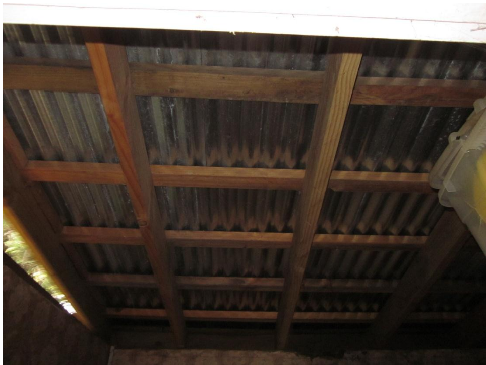
Photograph 14: Roof rafters and purlins at addition. Note lack of attachment to external wall.