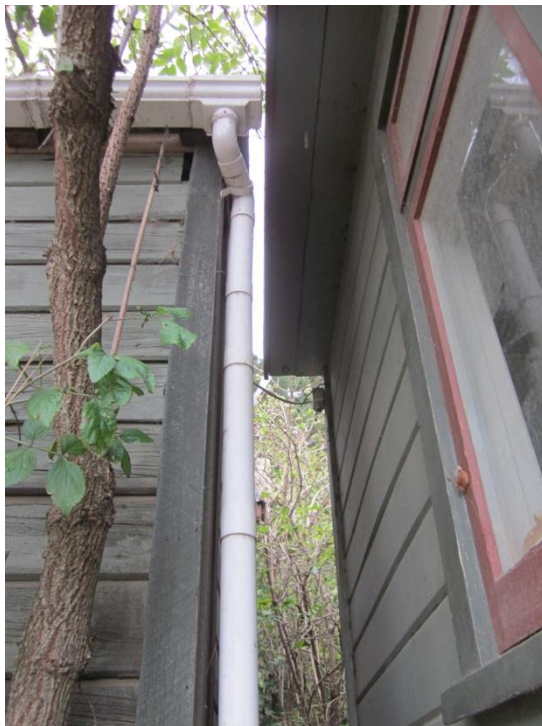
Photograph 12: Narrow gap between house structures.