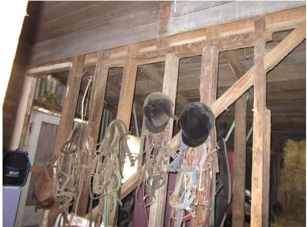
Photograph 15: Cross-braced internal wall (once external wall) at house, with addition beyond.