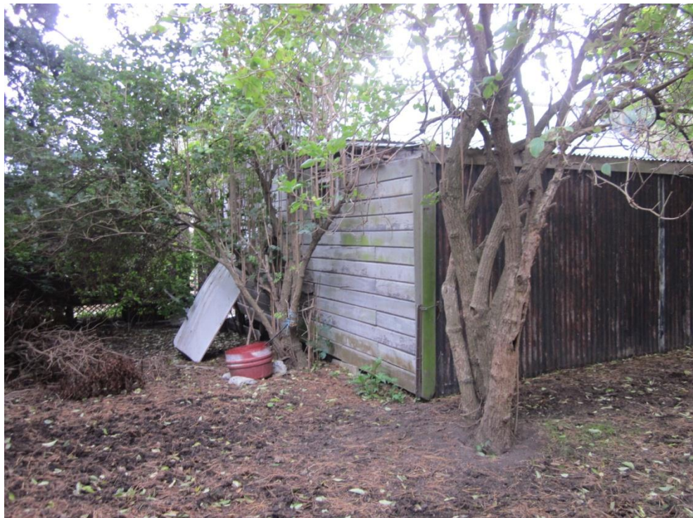
Photograph 6: Southwest elevation.