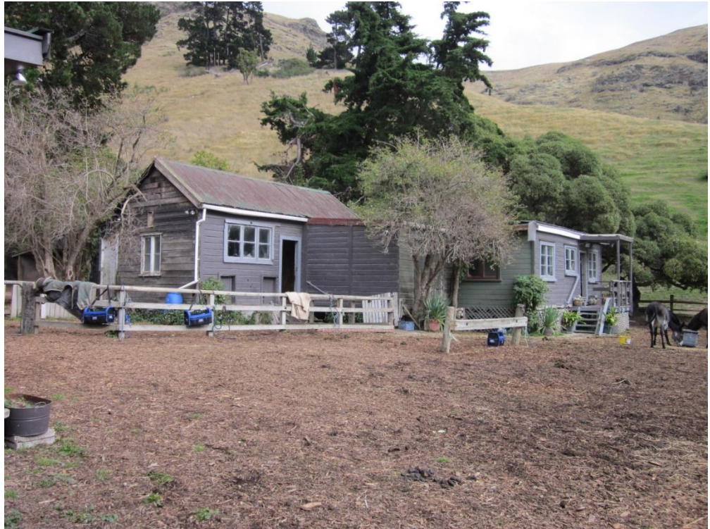
Photograph 1: Northeast elevation.