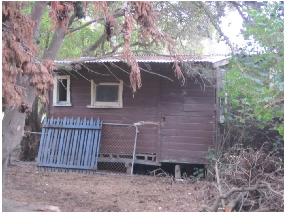
Photograph 5: South elevation.