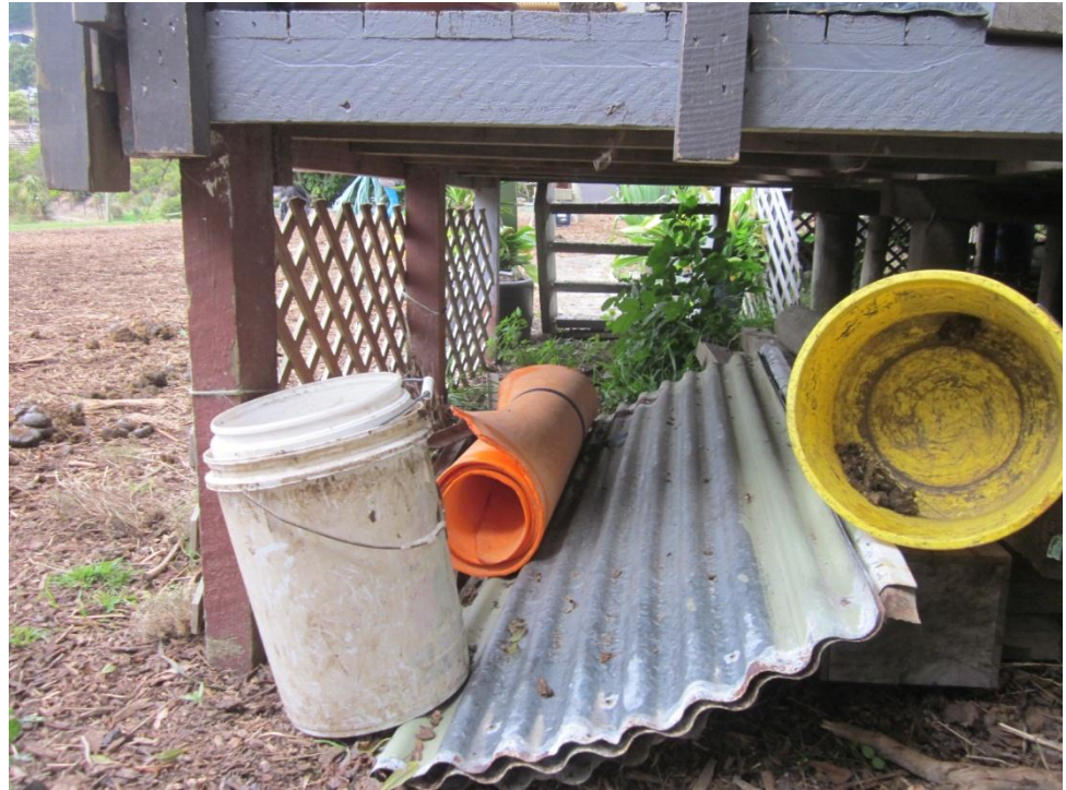
Photograph 11: Timber piles under entry landing at house.