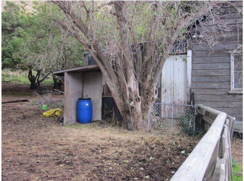
Photograph 3: East rear elevation.