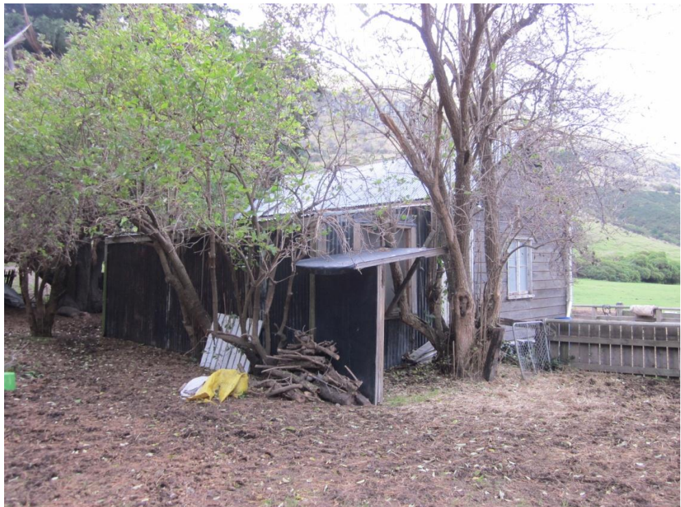
Photograph 4: Southeast corner elevation.