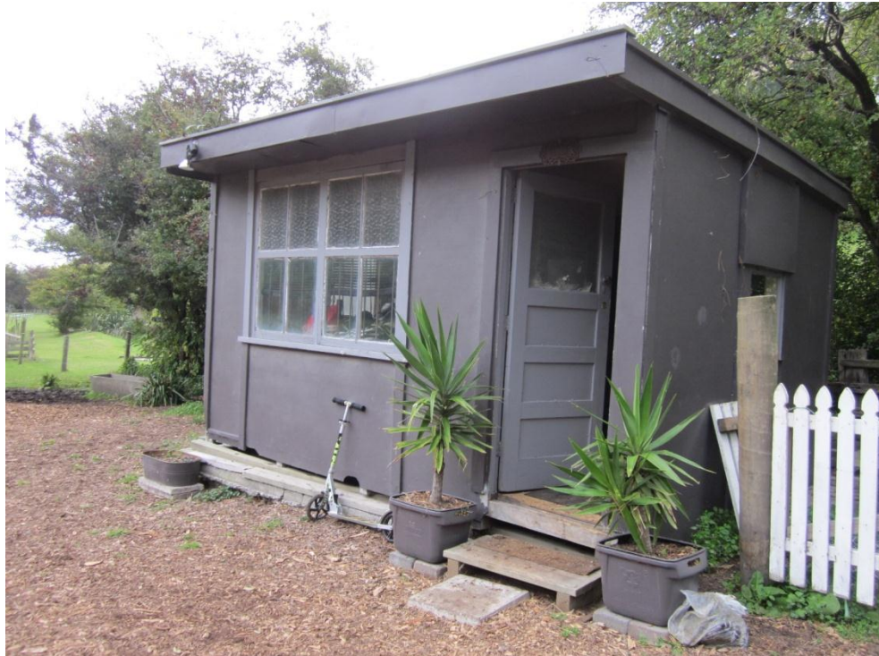
Photograph 7: Small shed structure on grounds.