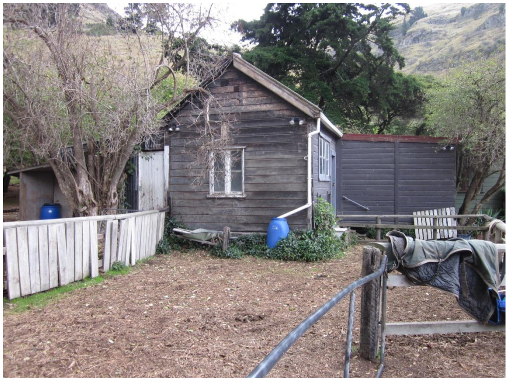
Photograph 2: East Elevation.