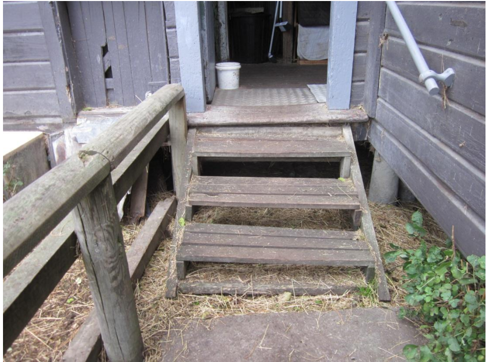
Photograph 9: Timber stair and piles at house entrance.