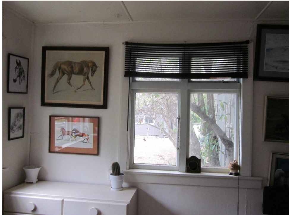
Photograph 13: Internal plasterboard linings at office area inside house.