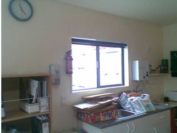
Photo 37: Office is approx 10 years old and showed little sign of damage with no noticeable separation of GIB linings along joints or cracking