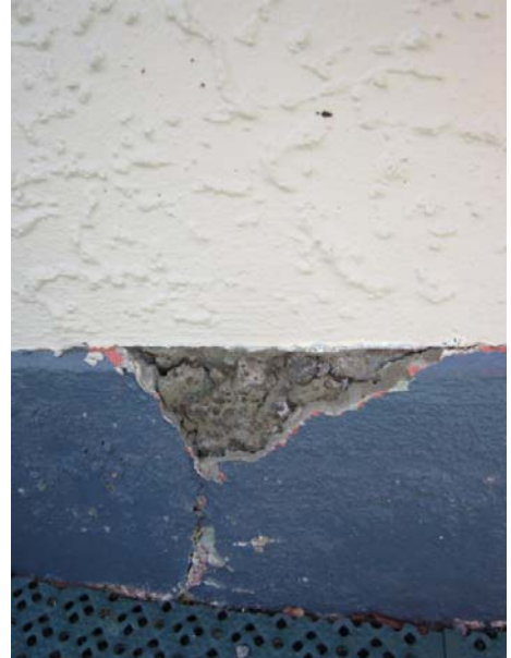
Photo 18: Potentially full depth cracking. Spalling of the plaster finishing