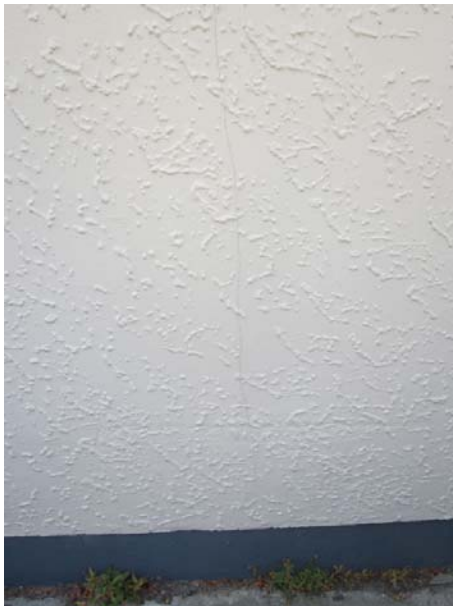
Photo 23: Vertical cracking typical around the building where internal timber framing is at a junction with exterior