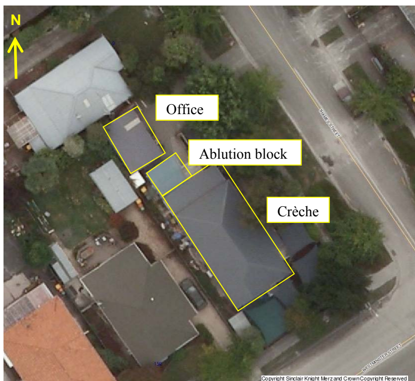
■ Figure 1 Aerial Photograph of 3 Thames Street

A Quantitative Assessment was carried out on the building located at 3 Thames St. The crèche located on this site comprises of two separate structural areas, these are the office and the day care. The offices are located at the north of the property and the day care is located directly adjacent to these to the south and is constructed from timber framing with metal cladding. An aerial photograph illustrating these areas is shown below in Figure 1. The Crèche building is assumed to be of circa 1965 design and construction consisting of steel clad roofing on a light timber framed roof. Walls are light timber framing with lathe and plaster linings providing bracing. The floor system is a timber floor sitting on timber framing supported by internal concrete piles and a concrete perimeter strip footing. Detailed descriptions outlining the buildings age and construction type is given in Section 5 of this report.