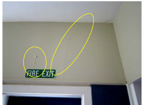
Photo 28: Typical damage to the lathe and plaster wall also seen in the ceiling lathe and plaster