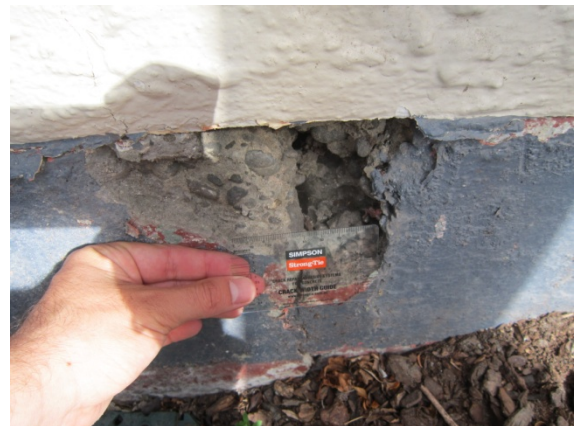
Photo 16: Full depth cracking through the perimeter ringbeam with approx 150 x 150 mm spalled area of covering plaster