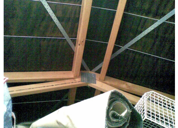
Photo 38: Storage area exposed roofing and bracing. Bracing appeared taut indicating low or no yielding