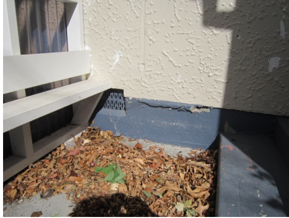
Photo 13: Cracking and spalling typical at foundation ventilation points