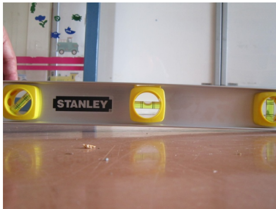
Photo 35: slope not approximated onsite but likely greater than 2% when compared to Photo 31