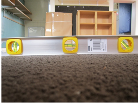
Photo 29: Distinct slope in the floor of the large eastern room. Room dips predominantly towards the south.