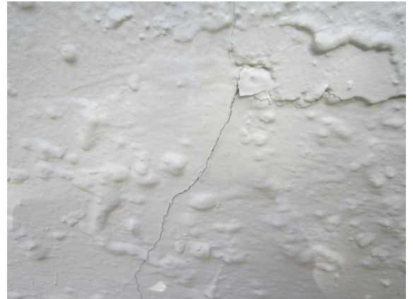
Photo 6: Typical cracking in stucco cladding, approx 0.5mm or less