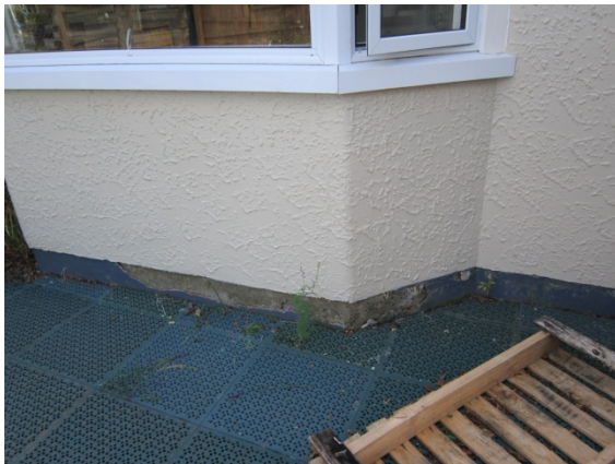
Photo 19: Photo of south wall perimeter ring beam showing plaster layer on concrete