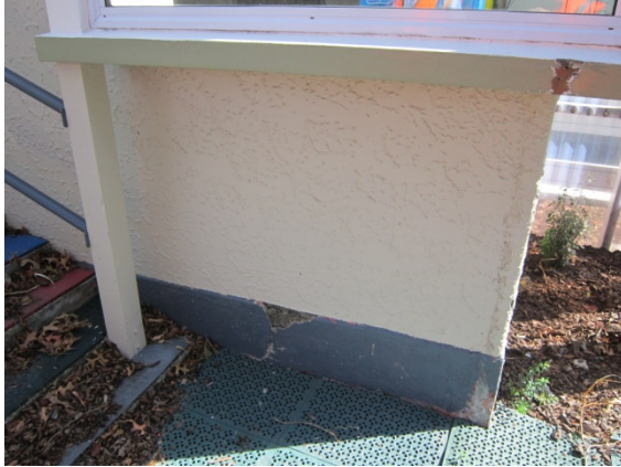
Photo 17: Further damage on the south face of the South east corner ring beam