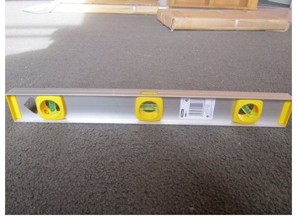
Photo 30: Room appears to bowl centred on the south wall of the main eastern room