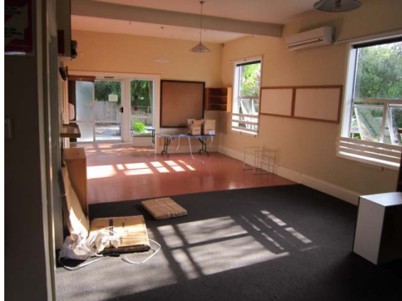
Photo 25: Main creche open area, severe settlement of the carpeted area