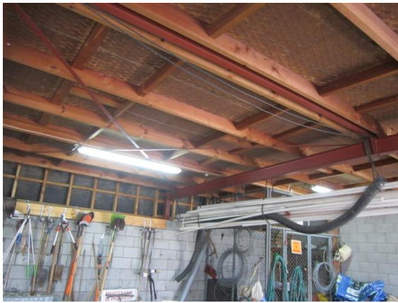
Photo 13: Interior view of 3 bay garage showing roof structure (3)