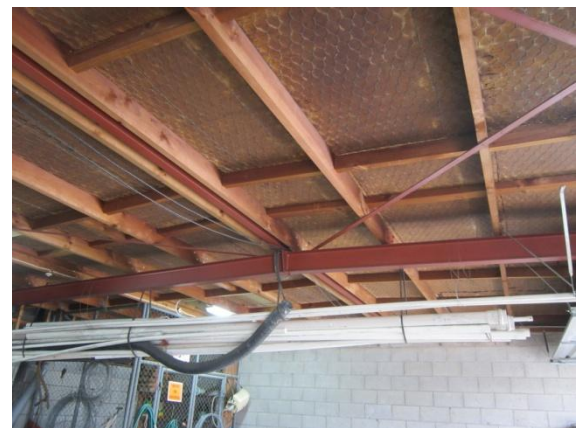
Photo 12: Interior view of 3 bay garage showing roof structure (2)