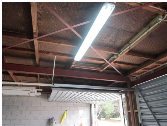
Photo 11: Interior view of 3 bay garage showing roof structure (1)