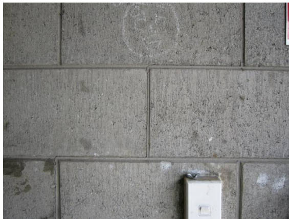
Photo 9: Close up view from photo 8 showing 0.6mm step cracks through masonry grout.