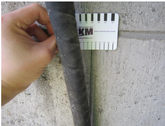
Photo 15: Close up view from photo 14 showing 0.5mm step cracks through masonry grout