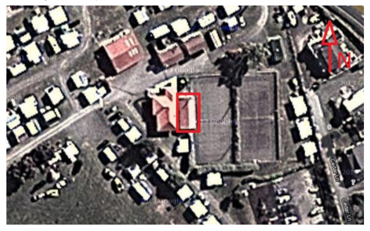
Figure 2 Duvauchelle Reserve Tennis Club Site Plan

The building is a single storey timber framed structure on concrete slab-on-grade foundations. The roof is pitched and is made up of timber rafters and lightweight metal cladding externally and plywood sarking internally. The roof of the building extends over the building's eastern walls to form a veranda on the eastern elevation of the building. The rafters are supported on veranda beams on timber posts embedded into concrete footing of unknown depth. The exterior wall cladding to the building comprises of lightweight timber weatherboard and metal cladding. Plywood lining is provided to the walls and ceilings internally.