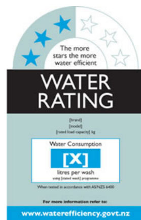
Water efficiency label – Ministry for the Environment

We have been installing water meters in recent years with the capability for conversion to 'smart' meter readings and estimate that over 50% of current meters are ready for smart communication technology to be fitted (at a cost). The key benefit of remote reading is a large reduction in the cost per reading, enabling more frequent readings (e.g. every 15 minutes). Smart metering has many benefits including early notification of leaks and meter issues and a better understanding of daily water use for each property.