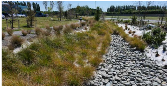
Stormwater control, Tait Industrial Park – Kelvin McMillan

A combination of regional policy statement, regional plan and district plan provisions would facilitate adoption of water sensitive design into developments where collective stormwater systems do not exist or have insufficient capacity. We are directly responsible only for district plan provisions. To implement this option we work closely with Environment Canterbury to ensure the regional planning framework appropriately facilitates the adoption of water sensitive design.