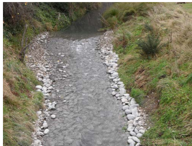
Knights Stream restoration riffle and fish pass

The basic approach of water sensitive design is described in relation to suggested approach 3 under objective 1, in relation to enabling the community to implement water sensitive design measures. Water sensitive design can also be applied at multiple scales, for structure planning, subdivision and site development. It is appropriate for both greenfield sites and brownfield redevelopment. It can have a significant positive effect in reducing adverse effects on water quality and can reduce the effects of downstream flooding by delaying discharges and utilising ground soakage to reduce immediate runoff.