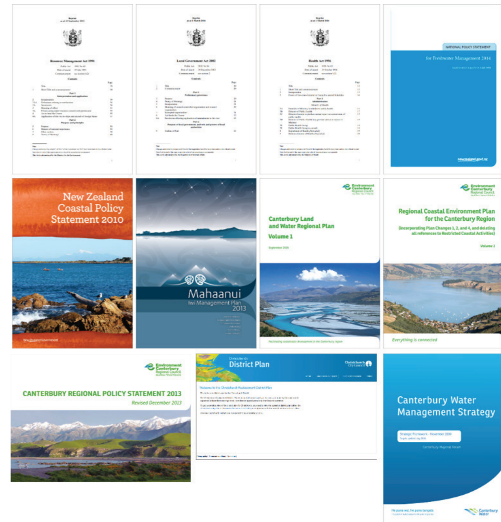
Statutes and policies influencing water management

The work of the zone committees and other parties in implementing the Canterbury Water Management Strategy will be relevant to implementing the Integrated Water Strategy.