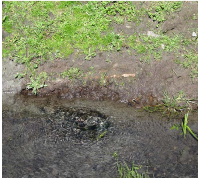
Spring, Wai-iti Stream

We will continue to work collaboratively with Environment Canterbury and Waimakariri and Selwyn District Councils to promote and enhance groundwater protection.