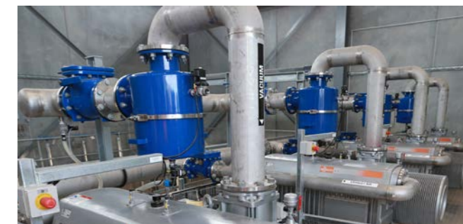
Pump station, Aranui, is an example of greater infrastructure resilience

There may be opportunities for projects undertaken to meet objective 2 to link to joint work programmes with Ngāi Tahu Papatipu Rūnanga and Mahaanui Kurataiao Ltd.