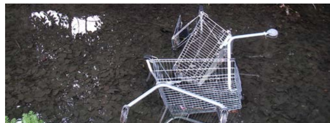
Shopping carts in the Avonhead area, Ōtākaro Avon River

Understanding the multiple uses and values of water is essential for driving change. If all uses of water are understood and valued, particularly surface waterways and sources of potable water, this will enable the draft strategy’s vision to be achieved. Furthermore, we are committed to working with iwi and hapū to identify and provide for manawhenua values and interests in freshwater management.