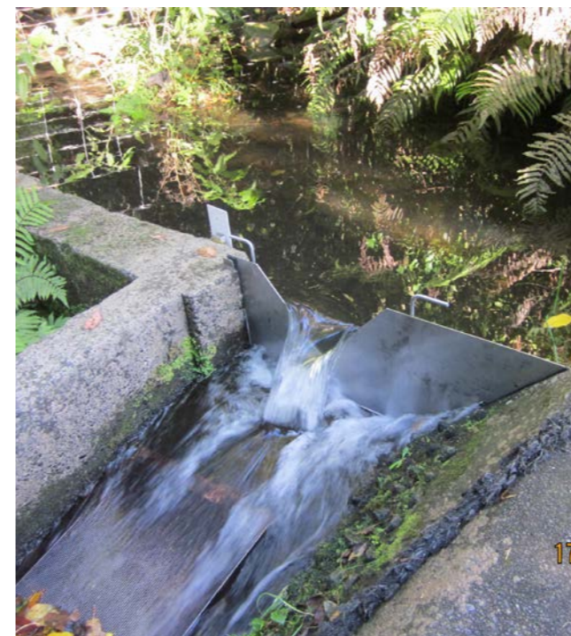
Aylmers Stream intake

Access to high quality drinking water is important and high quality drinking water should be used appropriately to ensure the long term availability of the existing water sources, to support guardianship of our drinking water sources particularly in light of the impacts of climate change. There are also significant social, health, cultural, environmental and economic costs of not providing a reliable and safe source of water supply to the community.