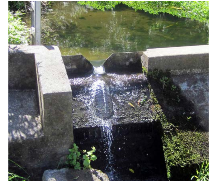
Intake for Duvauchelle water supply, Pipers Stream

demonstrably safe drinking water without the need for residual disinfection.