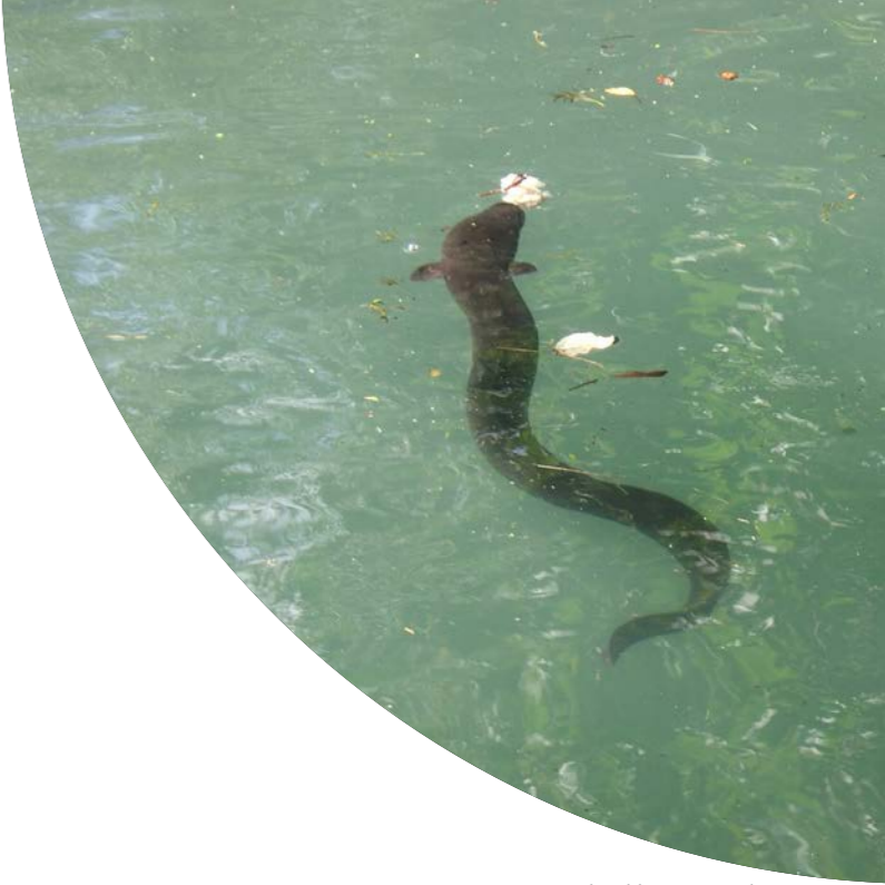
Eel grabbing a morsel