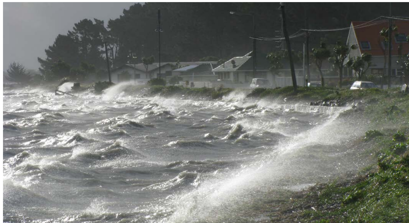
Storm waves in the estuary at South Brighton, 2009

Current planning is based on current predicted sea-level rise. The Council and the community need to be mindful that predictions may change and future sea-level rise may be greater than currently forecast. Development of dynamic adaptive planning pathways will be required in order to inform decisions in light of the uncertainty with sea-level rise predictions.