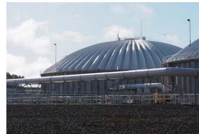
Trickling filters, Christchurch Wastewater treatment plant - Kelvin McMillan

Wastewater treatment and disposal needs for the Christchurch metropolitan area have been addressed for the next 20 years at least. Beyond 2040, Christchurch's wastewater treatment and disposal system may require changes to accommodate the new areas of growth in the north and southwest.