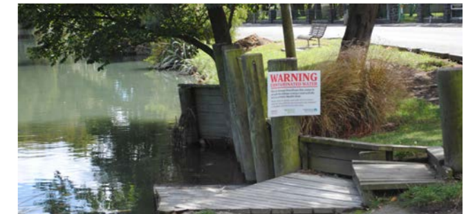
Warning sign, Ōtākaro Avon River, after 22 February 2011 earthquake

To date, infrastructure construction projects have been designed to both provide capacity for growth and to address wet weather overflow reduction. Preliminary post-SCIRT wastewater modelling results show that