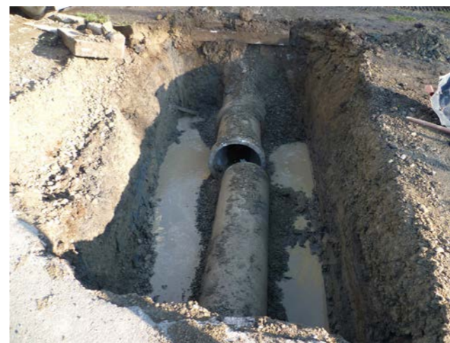
Earthquake damaged pipe

Ngāi Tahu have played a prominent and influential role in the re-build of Ōtautahi Christchurch, particularly around designing the urban environment in a way that respects the taonga status of its waterways. Ngāi Tahu wish to maintain this role and ensure that improved infrastructure is developed that reflects Ngāi Tahu values.