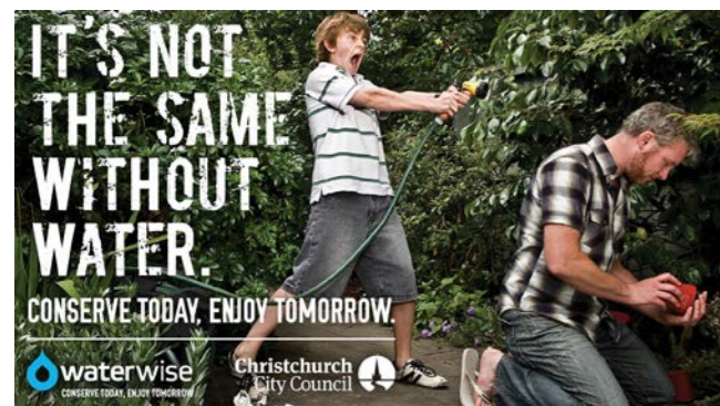
Waterwise campaign 2015/16

pressure management trial with the primary goal quantifying the benefits of reduced breakages, fewer service interruptions, lower leakage rates, increased asset life and lower power costs. A key finding from the earthquakes was that smaller zones also greatly assist in managing recovery of water supply systems should Christchurch experience another significant seismic event or other major disaster.