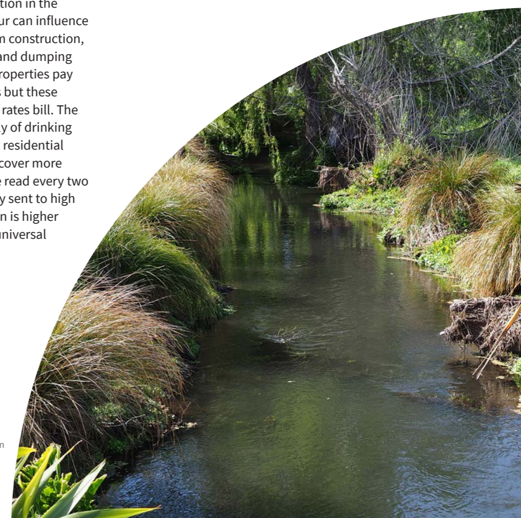
Kā pūtahi (Kaputone) Creek – Kelvin McMillan

The need for a ‘step-change’ in the way people value Christchurch water was identified in the stakeholder workshops. Advocacy and outreach initiatives would be the foundation to support other suggested approaches implemented for the draft strategy, valuing all of the waters needs to become a ‘top-of-mind’ issue for the majority of the population to achieve the ‘step-change’ required to a future where the waters are valued by all.