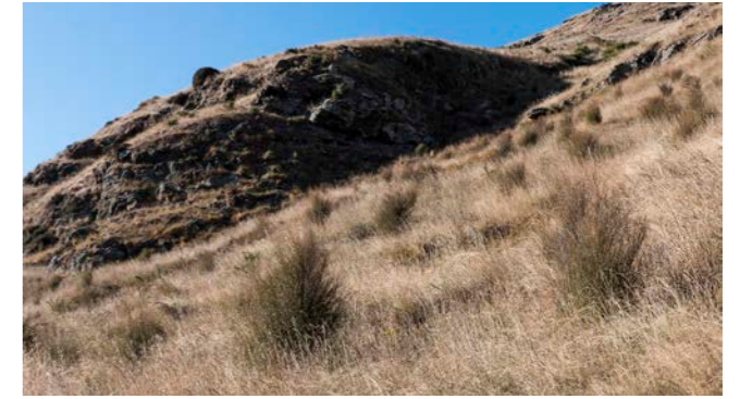
Planting for erosion control, Bowendale Park – Kelvin McMillan