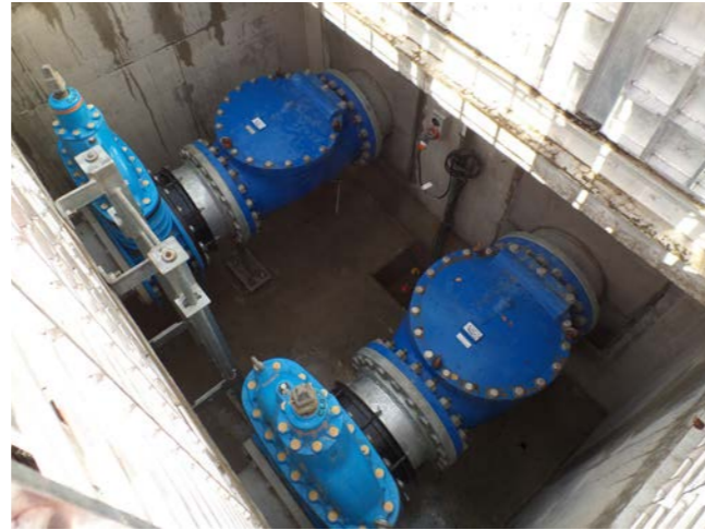
Tay Street Drain #1 check valves, part of Flockton Basin flood mitigation works