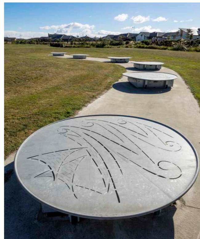
Retention basin drainage covers at Wigram Skies - Kelvin McMillan

Ongoing management of stormwater is essential and necessary to protect the quality of the groundwater and surface water resources of Christchurch. However, the design, development and installation of stormwater treatment can be expensive and complex, particularly in already developed areas where retrofitting devices is the only feasible option. In addition, 'hard' infrastructure alone is not likely to achieve a degree of contaminant reduction needed for substantive surface water quality improvements. Other 'source control' initiatives, such as behaviour change (e.g. switching to copper-free brake pads and being more vigilant on sediment discharge from construction sites) will be needed as well.