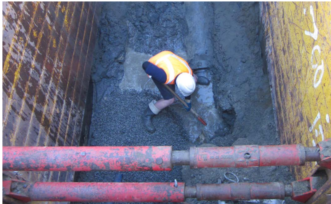
Wastewater pipe damaged in February 2011 earthquake

There is also the need for us to develop and retrofit additional stormwater, flood and wastewater treatment infrastructure. We need to ensure that infrastructure types are fit for purpose in the long term and to consider non-asset solutions where practical. Involving the community and in particular manawhenua in the design and development of water infrastructure is critical.