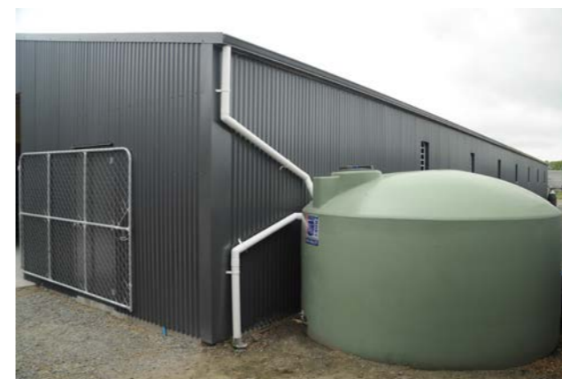
Using rainwater at Riccarton Park

Mana whenua noted that reuse and harvesting should be encouraged, particularly if residential volumetric pricing was introduced. Mana whenua consider that an advantage of residential volumetric charging could be the ability to enable incentives for incorporating reuse into sustainable house design e.g. greywater and rainwater harvesting.