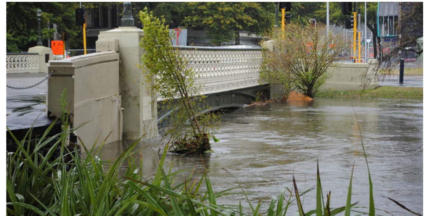
Ōtākaro Avon River flooding, March 2014

In some areas, groundwater is very close to the ground surface and inhibits the infiltration of floodwaters into the soil. This increases runoff, which may worsen flooding and sometimes leads to prolonged standing surface water.