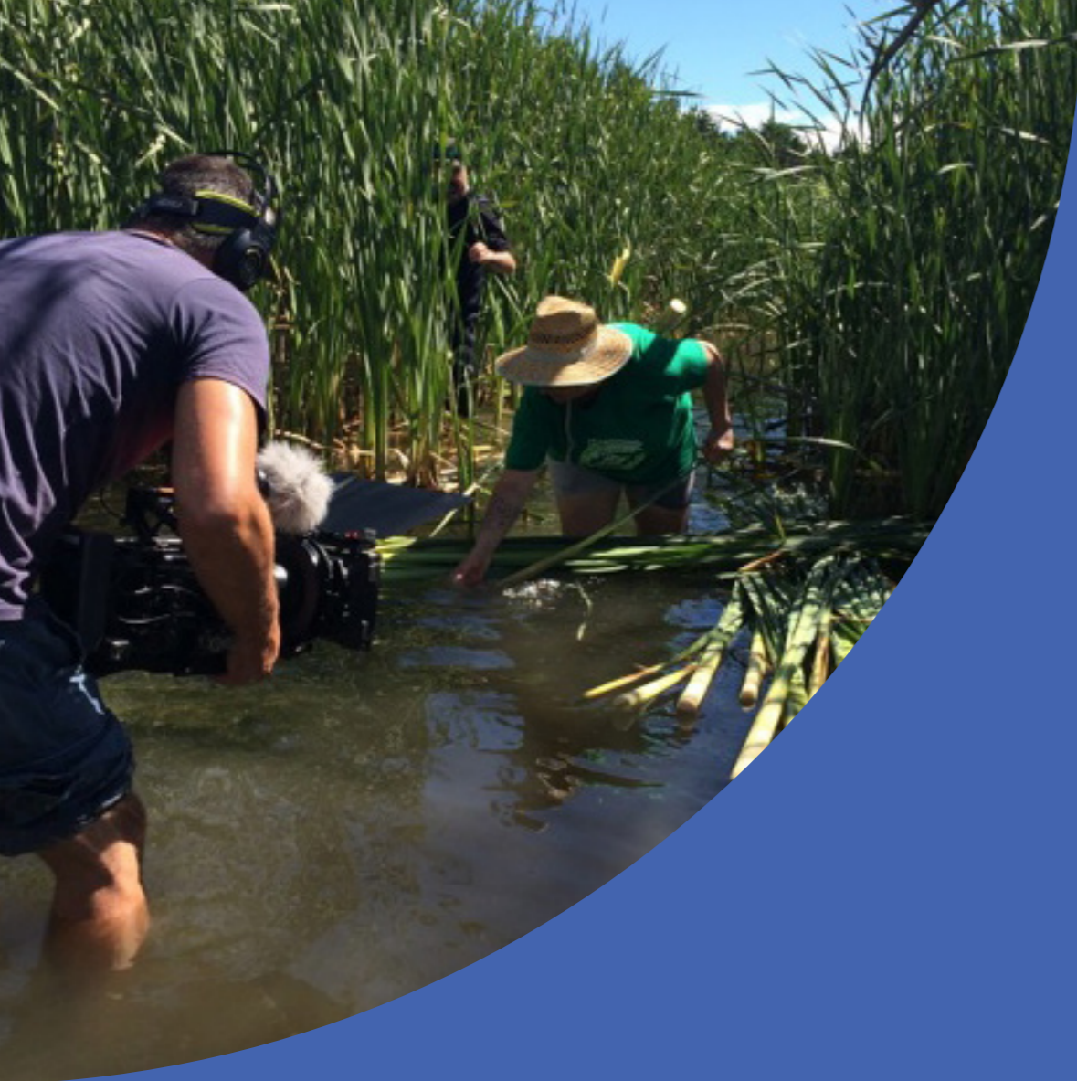
Image above: Gathering raupo