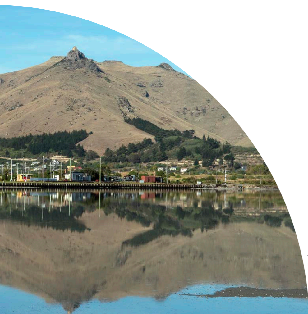
Te Tīhi o Kahukura Castle Rock reflected in lower Ōpāwaho Heathcote

The community in general and business and industry players also have key roles to play in implementing the strategy, as their actions have a direct impact on achieving the vision and goals.