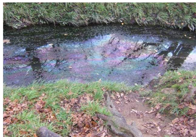
Diesel pollution in a portion of Addington Brook, June 2006

Good waterway health (i.e. water quality and habitat) is necessary for the protection of public health and safety, to safeguard the life-supporting capacity and ecosystems of surface water bodies, and in recognition of the need to provide for Māori cultural values. There is an increasing focus nationally on freshwater quality, and the community has clearly identified aspirations for improved waterway health throughout Christchurch.