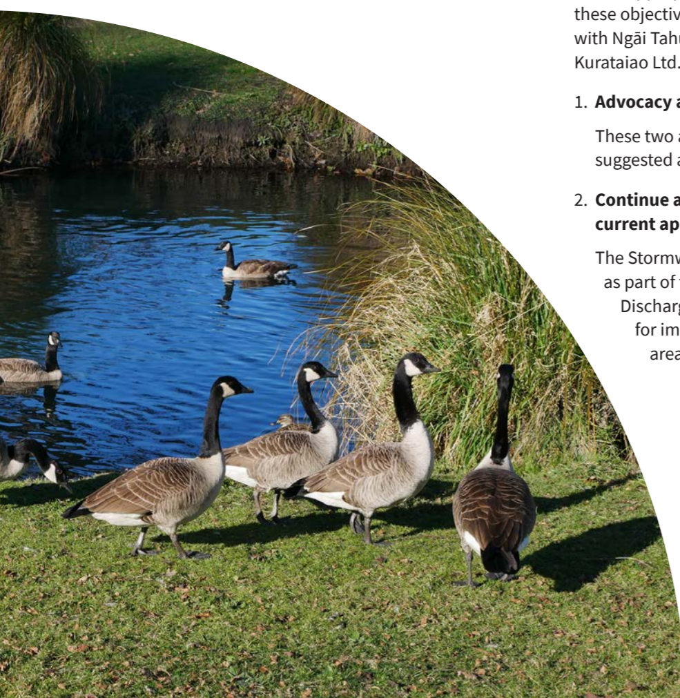
Canada geese along Ōtākaro Avon River