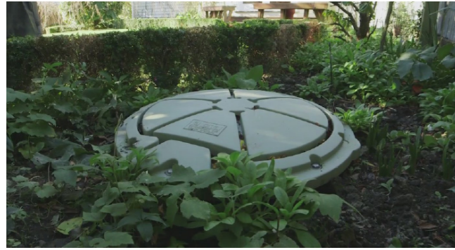
Pressure wastewater system, east-central Christchurch – Stronger Christchurch Infrastructure Rebuild Team (SCIRT)