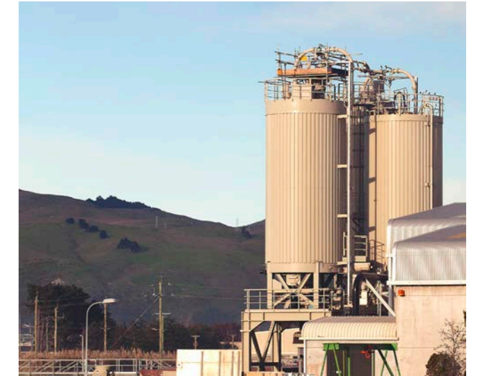
Biosolids dryer, Christchurch wastewater treatment plant

Improved management of trade waste could include regulatory or non-regulatory mechanisms to encourage trade waste customers to pre-treat at source.