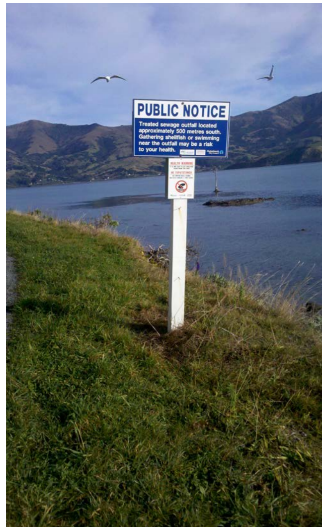
Signage near Akaroa wastewater outfall

Discharging treated wastewater to the harbour is offensive to members of the community. The discharge is particularly offensive to Ōnuku Rūnanga, whose preference is for the treated wastewater to be taken out of the harbour and irrigated onto land. We need to find a solution that balances the concerns of the community and Ōnuku Rūnanga, and environmental effects with appropriate use of ratepayer funds.