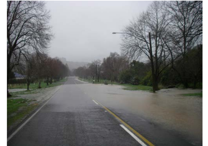
Flooding on Christchurch-Akaroa Road, August 2012