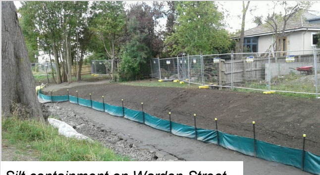
Silt containment on Warden Street