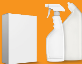
Unwanted, unused or old household liquid chemicals, cleaners, dry chemicals