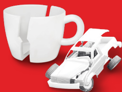
General waste e.g. broken toys, cups, plates

Reduce waste where you can. If you're unsure where something goes, you can view the full list on our Christchurch Wheelie Bins App .