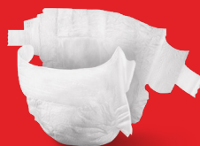
Nappies, animal waste, cat litter