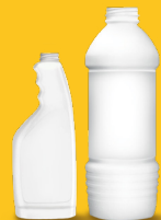
Empty cleaning containers with the numbers 1, 2 and 5 (lids in the red bin)