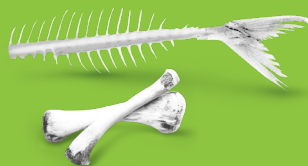
Leftover meat, bones, shellfish, fish