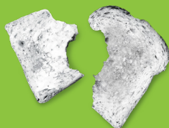
Bread, pastries, baked goods