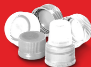
Plastic items smaller than a yoghurt pottle, lids, loyalty cards, coat hangers, garden pots