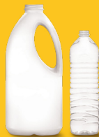
Plastic bottles numbered 1, 2 and 5 (lids in the red bin)