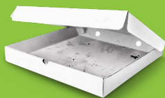
Fish 'n' chip wrappers, pizza boxes, kitchen paper towels, shredded paper, serviettes