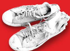
Damaged shoes, clothing, bedding, fabric