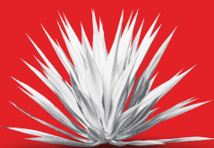
Timber offcuts, flax, cabbage tree leaves