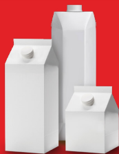
Empty liquid cartons e.g. juice, dairy, coconut milk, almond milk, custard