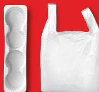
Soft plastics e.g. shopping bags, bubble wrap, shrink wrap, chip packets