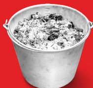
Cold ash (let ash cool for at least 5 days and put it in a bag in the red bin)