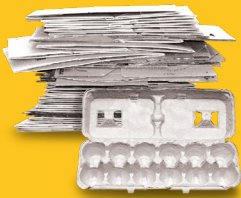
Flattened cardboard and egg cartons (no smaller than a standard envelope)

Give your bottles and containers a rinse, make sure they are loose, and put the lids in the red bin.