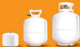
Camping gas canisters, helium bottles, gas bottles