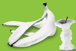
Fruit, vegetables, food scraps

Ash goes in the red bin. Let it cool for 5 days.