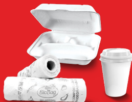
All compostable and biodegradable bags and packaging