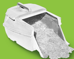
Garden waste (excluding flax and cabbage tree leaves)