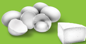
Cheese, eggs, butter