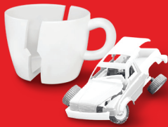
General waste e.g. broken toys, cups, plates

Reduce waste where you can. If you're unsure where something goes, you can view the full list on our Christchurch Wheelie Bins App .