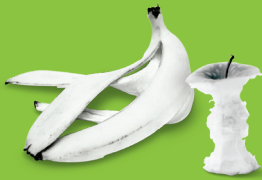
Fruit, vegetables, food scraps

Ash goes in the red bin. Let it cool for 5 days.