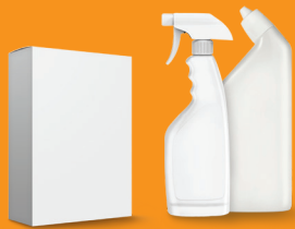
Unwanted, unused or old household liquid chemicals, cleaners, dry chemicals