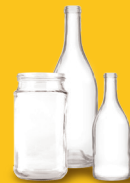
Clear and coloured glass bottles, jars (lids in the red bin)