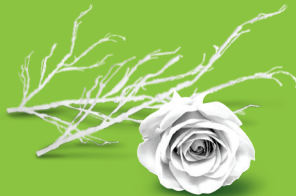
Cut flowers, cuttings, pruned branches