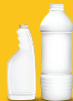
Empty cleaning containers with the numbers 1, 2 and 5 (lids in the red bin)