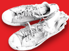
Damaged shoes, clothing, bedding, fabric