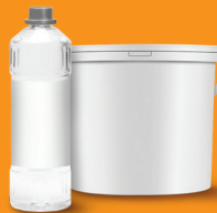
Unwanted, unused or old paints, solvents