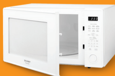
Appliances e.g. microwaves, fridges, dryers, washing machines