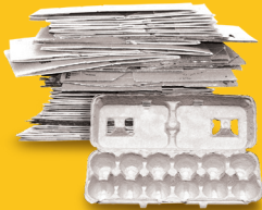
Flattened cardboard and egg cartons (no smaller than a standard envelope)

Give your bottles and containers a rinse, make sure they are loose, and put the lids in the red bin.