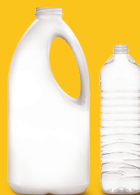
Plastic bottles numbered 1, 2 and 5 (lids in the red bin)