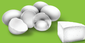
Cheese, eggs, butter