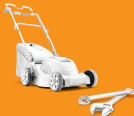
Tools, garden equipment