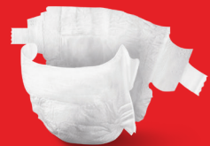
Nappies, animal waste, cat litter