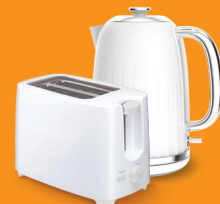
Small appliances e.g. kettles, jugs, pots, pans