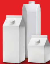
Empty liquid cartons e.g. juice, dairy, coconut milk, almond milk, custard