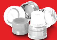
Plastic items smaller than a yoghurt pottle, lids, loyalty cards, coat hangers, garden pots