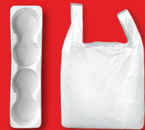
Soft plastics e.g. shopping bags, bubble wrap, shrink wrap, chip packets