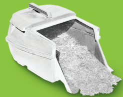
Garden waste (excluding flax and cabbage tree leaves)