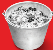
Cold ash (let ash cool for at least 5 days and put it in a bag in the red bin)