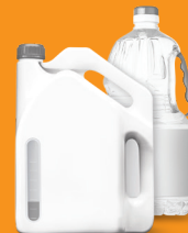
Unwanted, unused or old oil e.g. vehicle oil, cooking oil