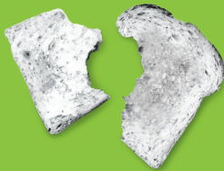
Bread, pastries, baked goods