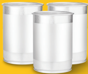
Metal tins (lids in the red bin)