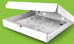
Fish 'n' chip wrappers, pizza boxes, kitchen paper towels, shredded paper, serviettes