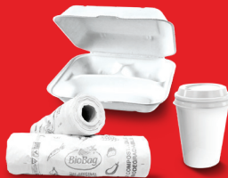
All compostable and biodegradable bags and packaging