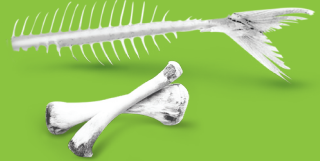
Leftover meat, bones, shellfish, fish