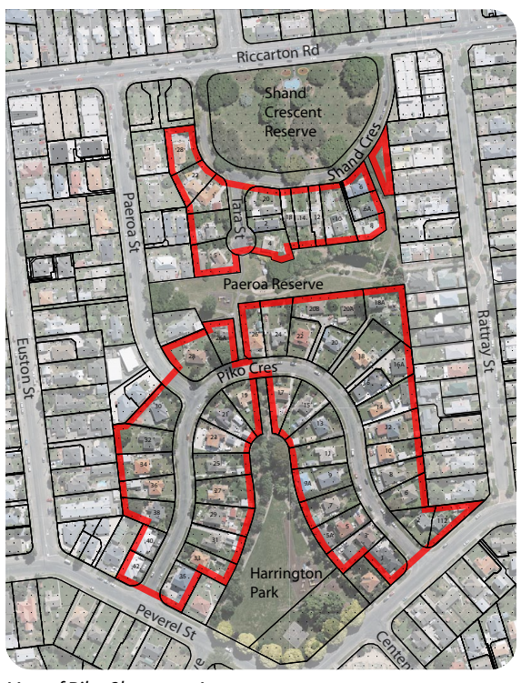
Map of Piko Character Area

Piko has city-wide significance as an intact residential neighbourhood with a strong sense of place and identity. This comprehensively designed state housing development, established in the late 1930s, has historical importance. The key elements that contribute to the character of Piko are: