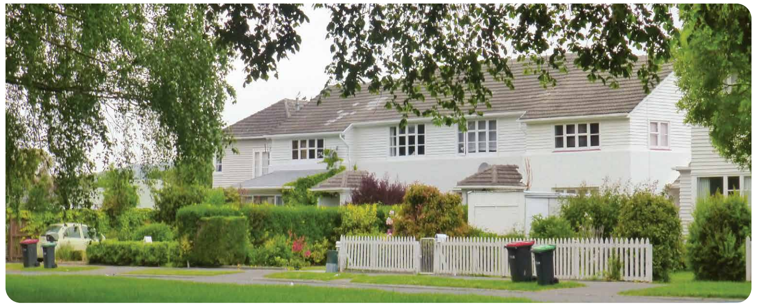
Example of a row of houses on Shand Crescent