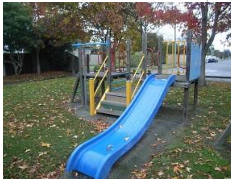
Junior Modular Unit Type