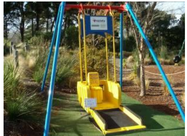
A disabled swing seat.