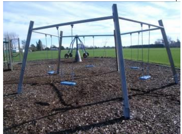
A swing with five standard seats.

Swings allow a person to oscillate back and forth in a pendulum like motion. Typically a swing is a seat suspended from an overhead beam by chains. More than one seat can be suspended from the same beam. A standard swing seat is a flat board or flexible belt that is sat on. An infant swing seat has holes for legs, a safety belt in the front and a high back. Disabled swing seats are platforms capable of wheelchair access. When recording swings the total number of swing seats, number of standard swing seats, number of infant swing seats and the number of disabled swing seats must be recorded.