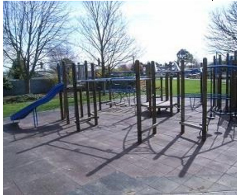
Senior Modular Unit Type