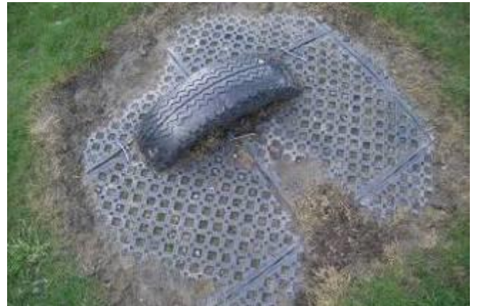
Matta tile playground surface. This playground surface has a flush surface level with no border.