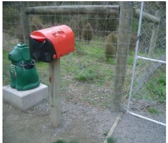
A bag dispenser (red) alongside a canine waste bin (green).