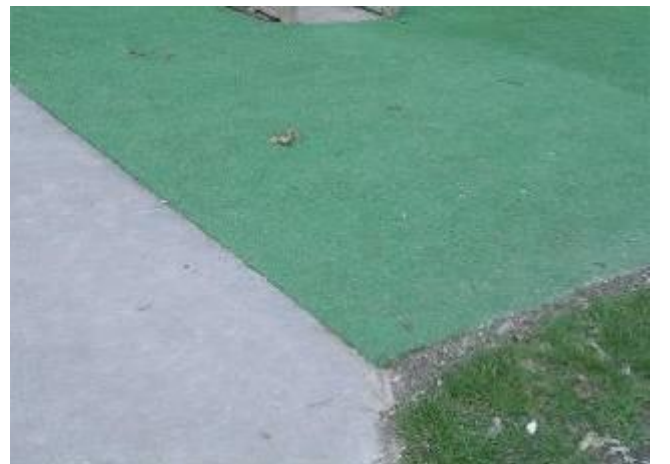
Safety matting playground surface. This playground surface has a flush surface level with no border.