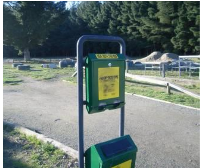
A bag dispenser mounted above a canine waste bin.