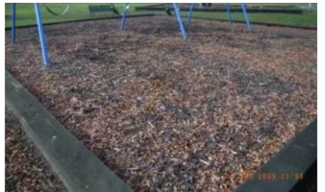
Bark nugget NZS5828 playground surface. This playground surface has an elevated surface level with a wooden border.