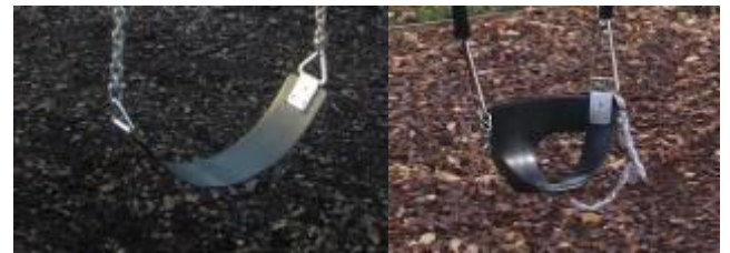
Standard and infants swing seats.